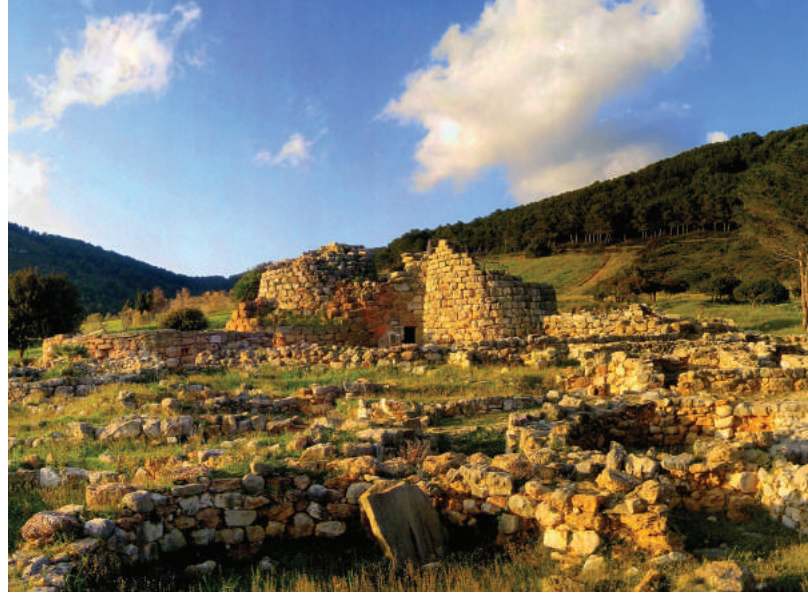
Segesta, photo by Ulbrecht Hopper (left) and Nuraghe Palmavera, Alghero, photo by Sardinia Tourist Guide (right)