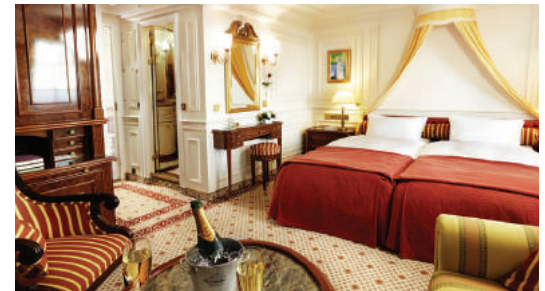
Sea Cloud II Lido Deck (top) and Junior Suite (above)