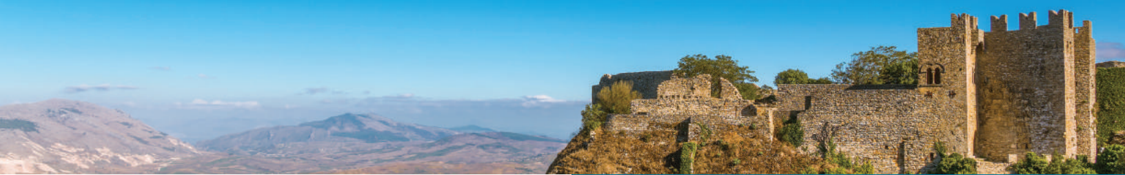
Erice (above); Front cover: Bonifacio. Back cover: Portoferraio, Elba (top) and Alghero, Sardinia (bottom).