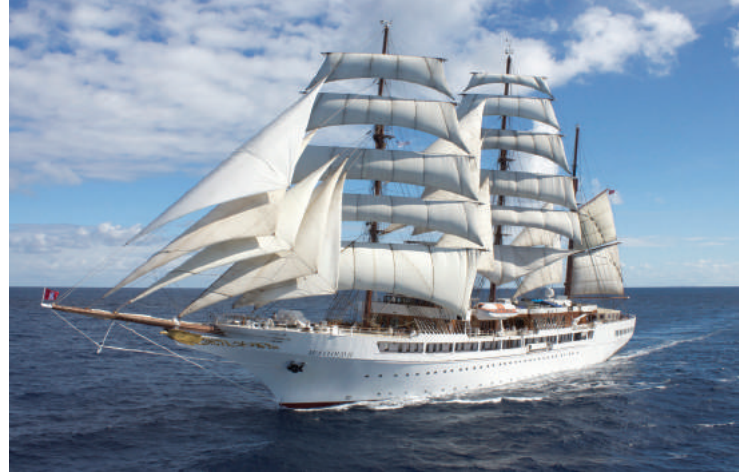
Sea Cloud II

Sea Cloud II is a three-masted sailing yacht steeped in the elegance of yesteryear and complemented with the most modern amenities. Sister ship of the legendary Sea Cloud , Sea Cloud II has 47 outside cabins and travels under 23 billowing sails trimmed by hand. From the mahogany-paneled library and gracious lounge to the gym and watersports platform, no detail has been overlooked. Praised by the world's most discerning travelers, Sea Cloud II receives consistently high rankings from Condé Nast Traveler . Passengers enjoy open seating at all meals and complimentary use of all water sports equipment. A doctor is on call 24 hours a day. Please note: There is no elevator on Sea Cloud II .