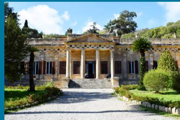
Villa San Martino, Elba

Law School during its Winter Term—most recently as the Jeremiah Smith, Jr., Visiting Professor of Law. The first Harvard graduate to earn joint degrees in law and in engineering, he was awarded a Sheldon Fellowship upon graduation. One of the world’s leading experts on drinking water and environmental markets, he regularly comments in the media on environmental issues. There have been over 110,000 downloads of his publications. An engaging lecturer, he was twice voted “Professor of the Year” by students at Duke University. His popular books, Drinking Water: A History and Mine! How the Hidden Rules of Ownership Control Our Lives , have been featured in The New Yorker , The Washington Post , The New York Times , and NPR’s Weekend Edition , among others.