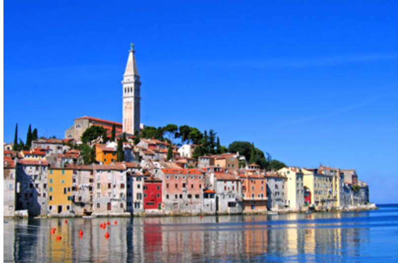
Left: Lake Bled; Right: Rovinj