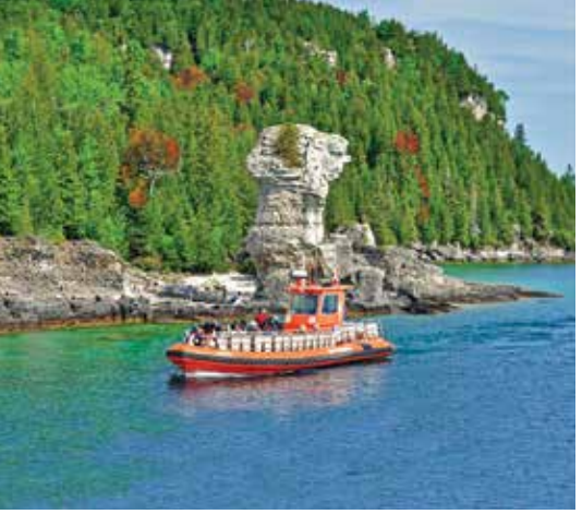
Cruise the azure waters of Fathom Five National Marine Park and discover the ethereal beauty of Flowerpot Island, where ancient cedars rise above surreal rock formations.

One of the world's most awe-inspiring natural phenomena, Niagara Falls never fails to impress. Cruise toward the mist-enshrouded base of Horseshoe Falls and experience firsthand the sheer force of this geological wonder. See the 410-million-year-old rock layers of the Niagara Gorge and the formidable Whirlpool Rapids, among the world's most extreme Class VI rapids. Enjoy a specially arranged lunch with spectacular falls views. See the Sir Adam Beck Power Station, the world's first large-scale hydroelectric generation project, and admire Niagara's famous Floral Clock, intricately filled with 20,000 plants