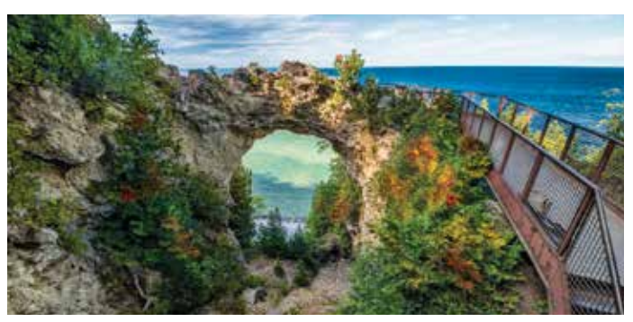
Discover the natural limestone of Arch Rock, rising 146 feet over Mackinac Island.

Enjoy the breathtaking views of the Lake Superior shoreline.