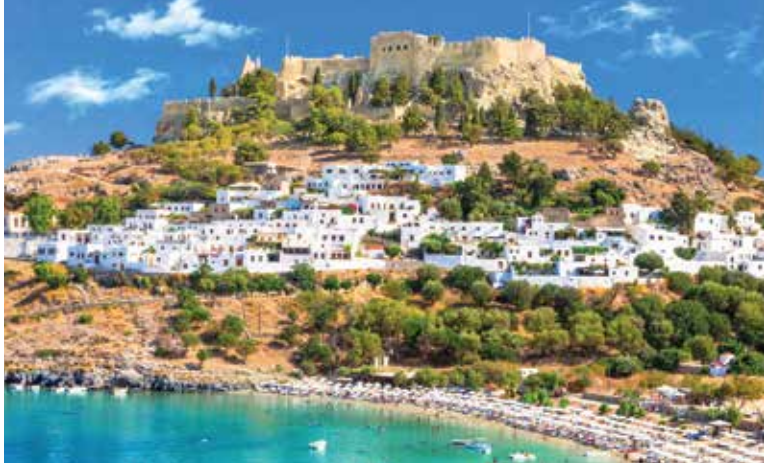
Be inspired by spectacular coastal views from the Lindos Acropolis, built 380 feet above the town.