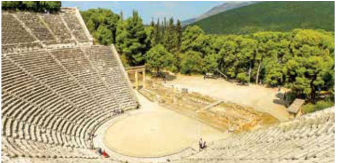
Enjoy the near-perfect natural acoustics of the theater at Epidaurus, built in the fourth century B.C.

Attend the Captain's Welcome Reception this evening. (B,L,R,D)