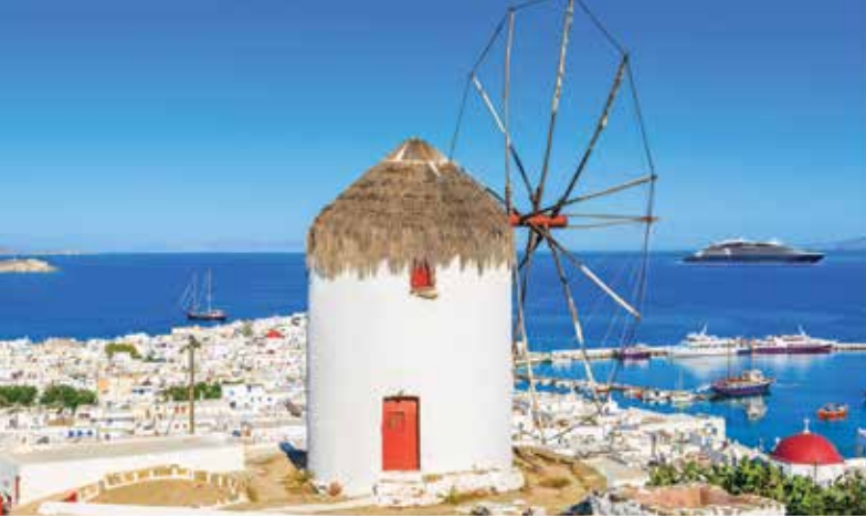
Visit Mykonos' classic round windmills, which were once used to grind wheat on the island.