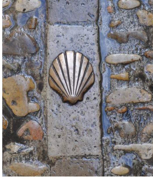
Camino de Santiago Shell, Estella