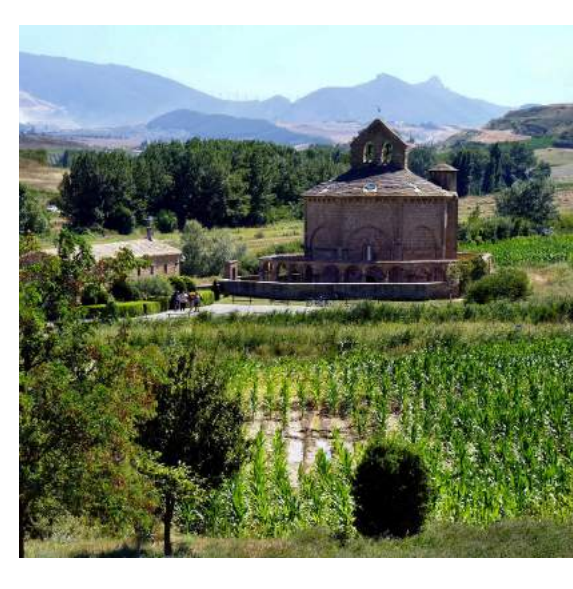
Church of Santa María de Eunate, Pamplona