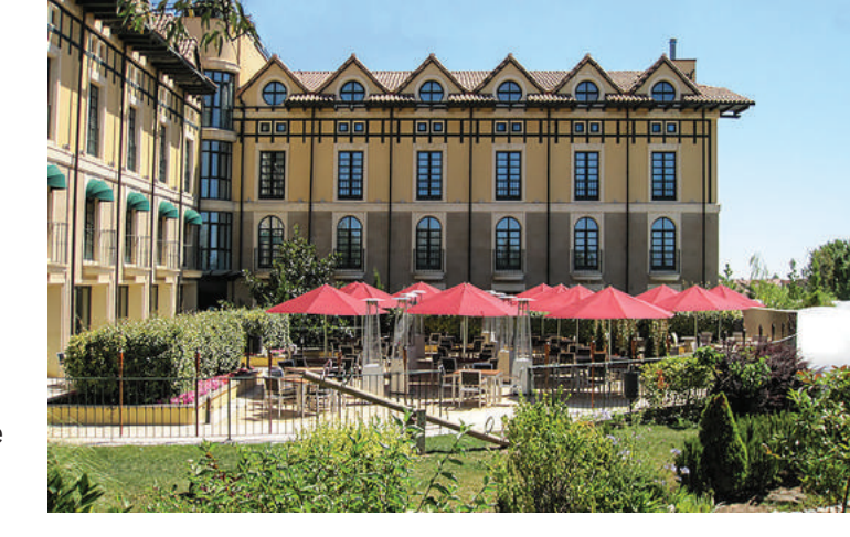
Hotel Villa de Laguardia

Minutes from the Cathedral of Santiago de Compostela, enjoy the tranquility of an 18th-century Franciscan convent with four-star amenities, including a heated swimming pool and Jacuzzi.