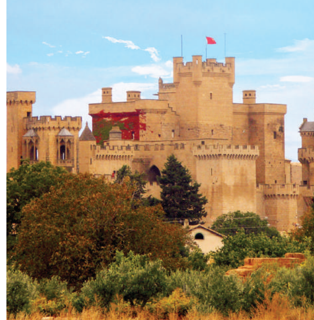
Map of the region (left) and Palace of the Kings of Navarre, Estella, (right)