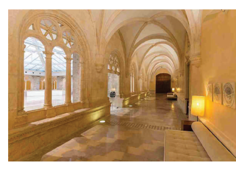
Hotel NH Palacio de La Merced