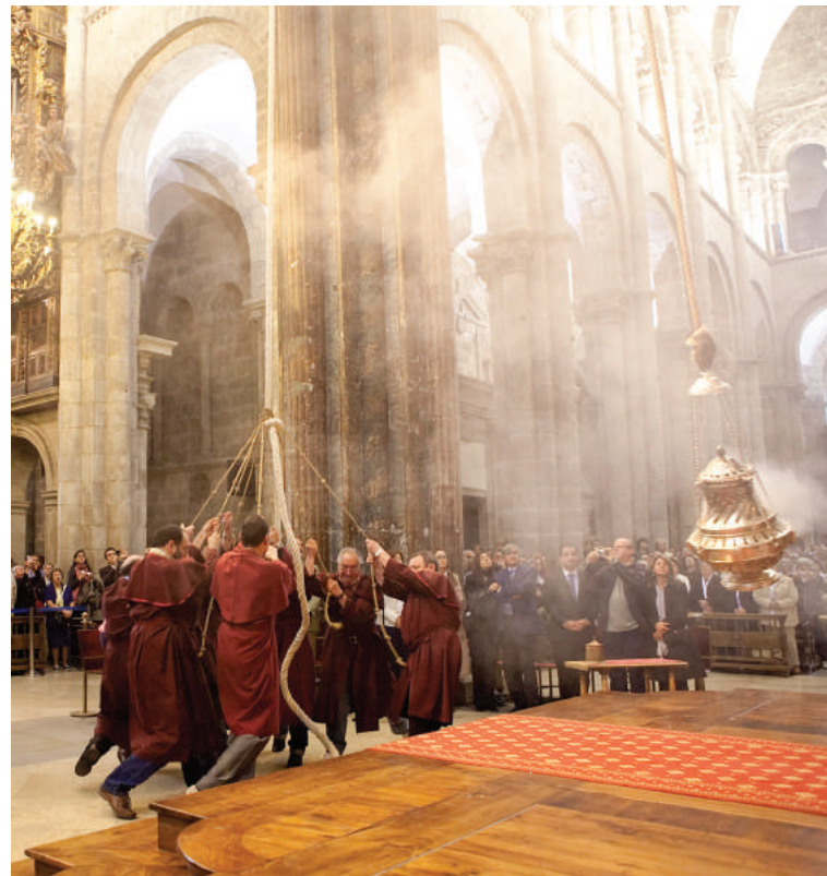
Cathedral of Santiago de Compostela (left) and Botafumeiro ritual (right)