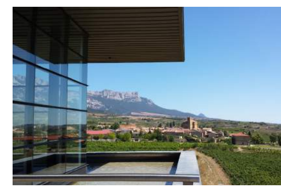
Bodegas Baigorri, Laguardia

Depart the hotel early this morning for your flight home.