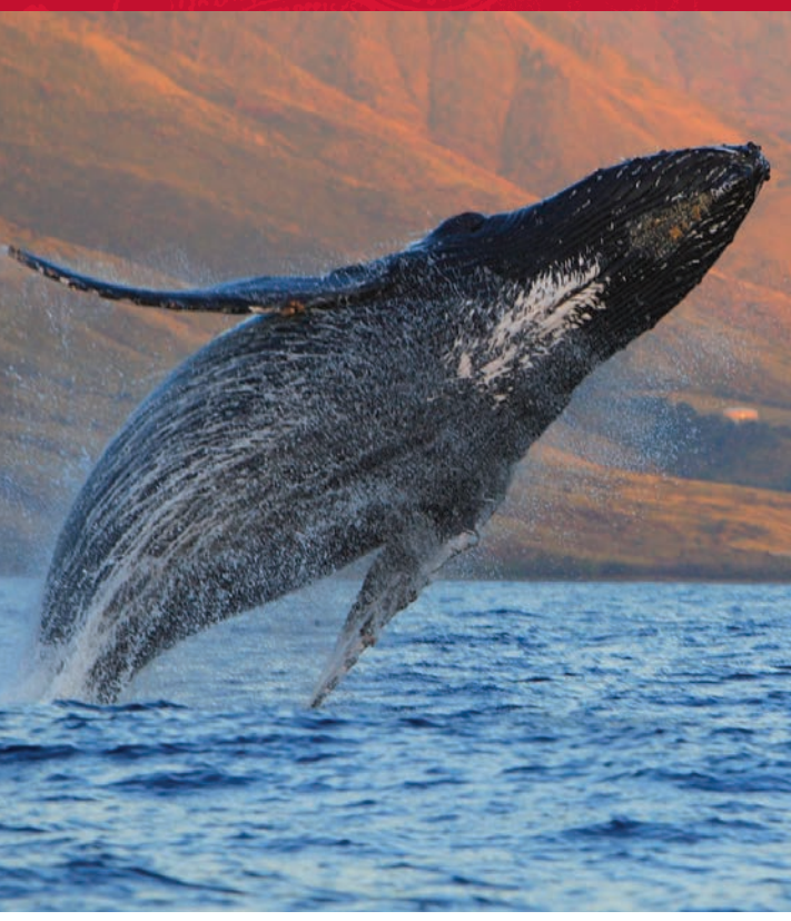
Marvel at the diversity of flora and fauna in Hawaii, including humpback whales, scented plumeria, colorful tropical fish, exotic Silversword