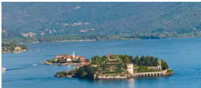
Cruise past Isola Madre, the largest of the Borromean Islands, home to a diverse array of plants from every continent.

Cruise among Lake Maggiore's enticing islands, graced with elegant villas and striking natural beauty.