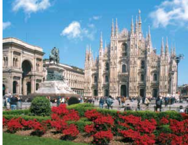
Admire the 14 th -century Piazza del Duomo, which marks Milan's geographic, social and cultural heart.