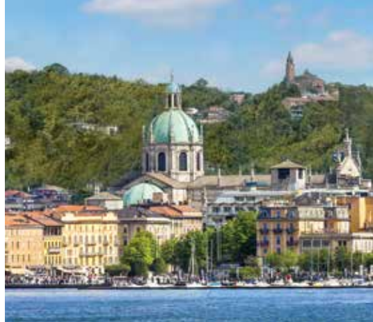
Enjoy Como's world-class architecture, including the 14 th -century Duomo di Como, financed by a prospering silk industry.