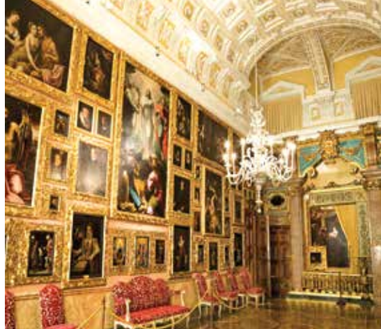
The Palazzo Borromeo showcases the works of Giulio Cesare Procaccini and Luigi Pellegrini Scaramuccia.