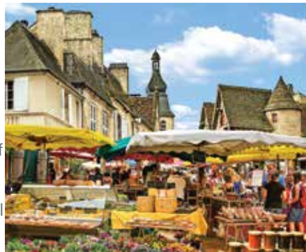
Visit Sarlat-la-Canéda's twice-weekly market, a medieval tradition in the heart of the village.

Among the "most beautiful villages" of France and called "The Acropolis of Périgord" for its perch atop a limestone promontory, Domme is an authentic medieval bastide, or fortified village laid out according to a geometric plan. Enter through its original ramparts and see graffiti etched by the Knights Templar on the inner village walls. The beauty of the 13 th - and 14 th -century architecture of