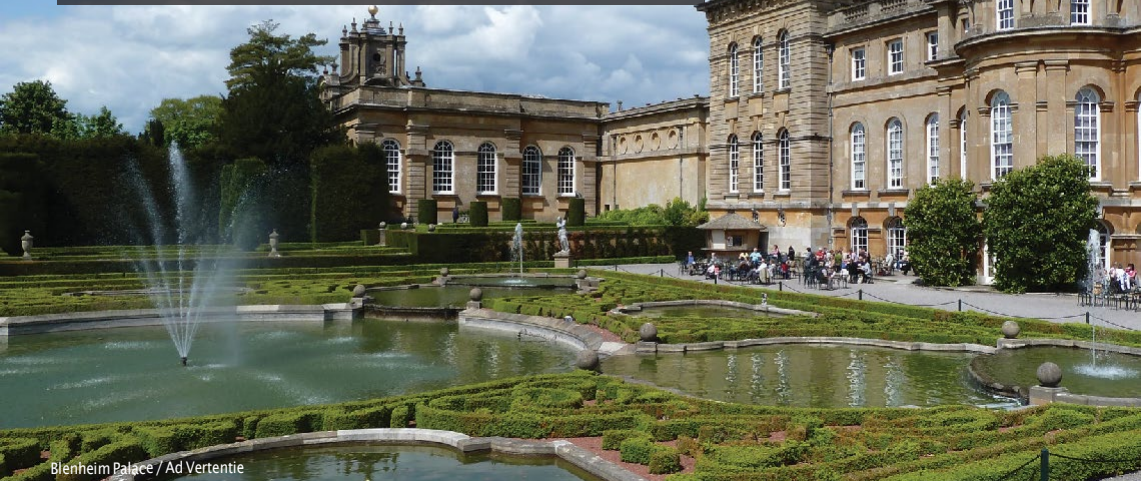
Blenheim Palace