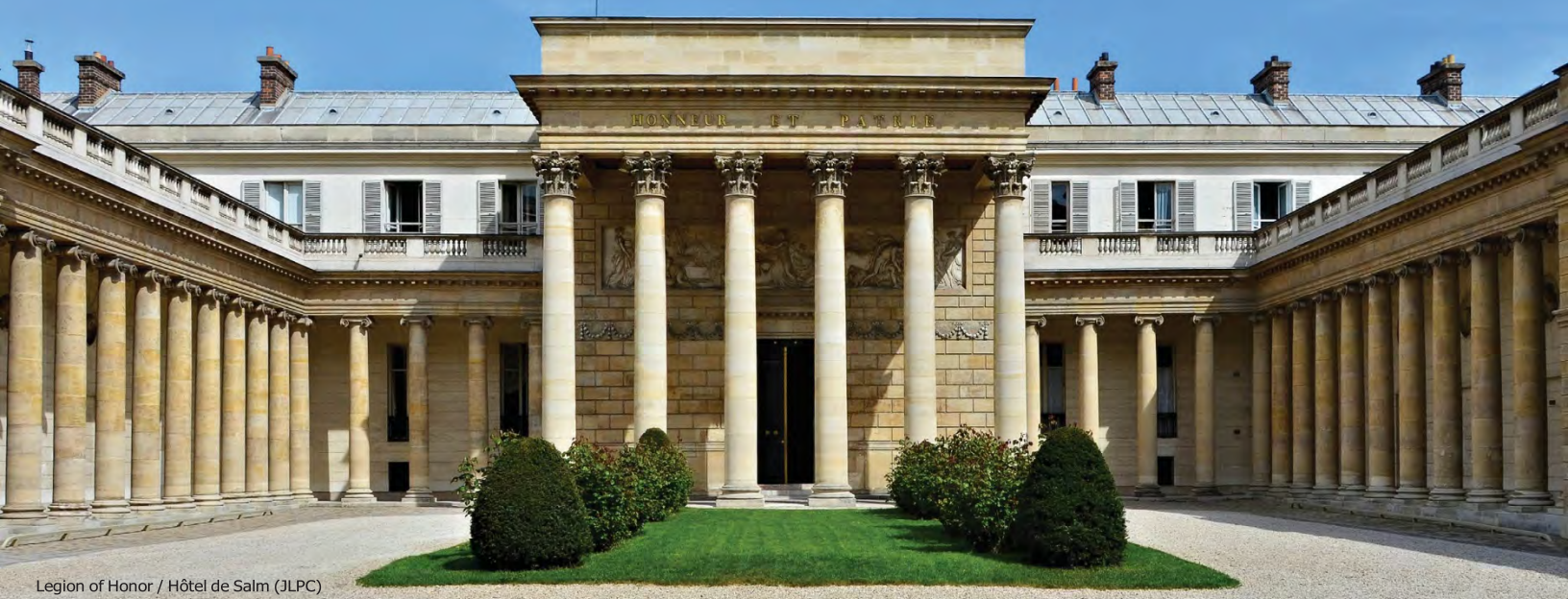
Legion of Honor / Hôtel de Salm

Led by historian and author Annette Gordon-Reed, immerse yourself in late 18th-century Paris and trace the footsteps of our Founding Fathers: Thomas Jefferson, Benjamin Franklin, John Adams, and other early Americans, reliving their encounters and triumphs, and visiting the places that inspired them.