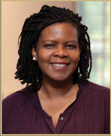
Annette Gordon-Reed Author, professor, and alumna of Dartmouth (Class of 1981) and Harvard Law School (1984)

ANNETTE GORDON-REED is the Carl M. Loeb University Professor at Harvard. Gordon-Reed won sixteen book prizes, including the Pulitzer Prize in History in 2009 and the National Book Award in 2008, for The Heminges of Monticello: An American Family (W.W. Norton, 2008). In addition to articles and reviews, her other works include Thomas Jefferson and Sally Hemings: An American Controversy (UVA Press, 1997), Vernon Can Read! A Memoir , a collaboration with Vernon Jordan (PublicAffairs, 2001), Race on Trial: Law and Justice in American History (Oxford University Press, 2002), a volume of essays that she edited, Andrew Johnson (Times Books/Henry Holt, 2010) and, with Peter S. Onuf, “ Most Blessed of the Patriarchs ”: Thomas Jefferson and the Empire of the Imagination (Liveright Publishing, 2016). Her most recent book is a memoir/history of Texas, On Juneteenth (Liveright Publishing, 2021). Gordon-Reed was the Vyvyan Harmsworth Visiting Professor of American History at the University of Oxford (Queens College) 2014-2015.