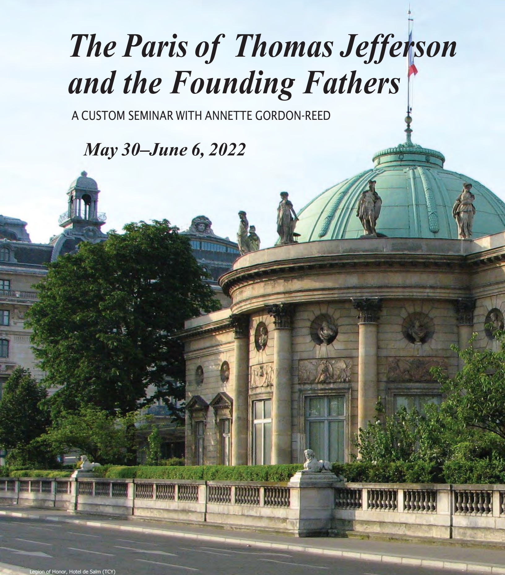
Legion of Honor, Hotel de Salm (TCY)

This custom-designed travel program has been created uniquely for: