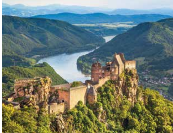
Cruise along the Danube River through the stunning natural beauty of the Wachau Valley landscape, a UNESCO World Heritage site.