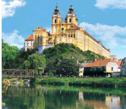
See 900-year-old Melk Abbey, originally an opulent Baroque palace, now a museum and learning center.

This afternoon, from specially reserved seats, enjoy the 2022 Passion Play, featuring a cast of all local residents and extraordinary stage sets. During intermission, enjoy a dinner of traditional Bavarian fare. (B,L,D)