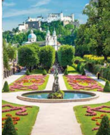
Stroll through the Baroque pleasure gardens of Mirabell Palace in the heart of Salzburg.