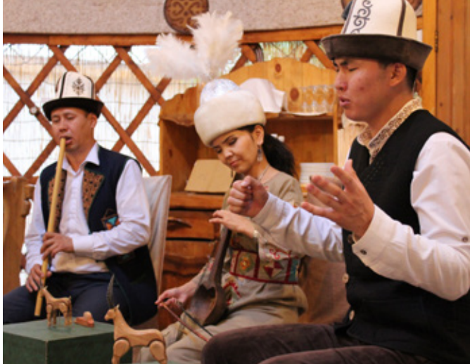
Left: caption. Right: caption.