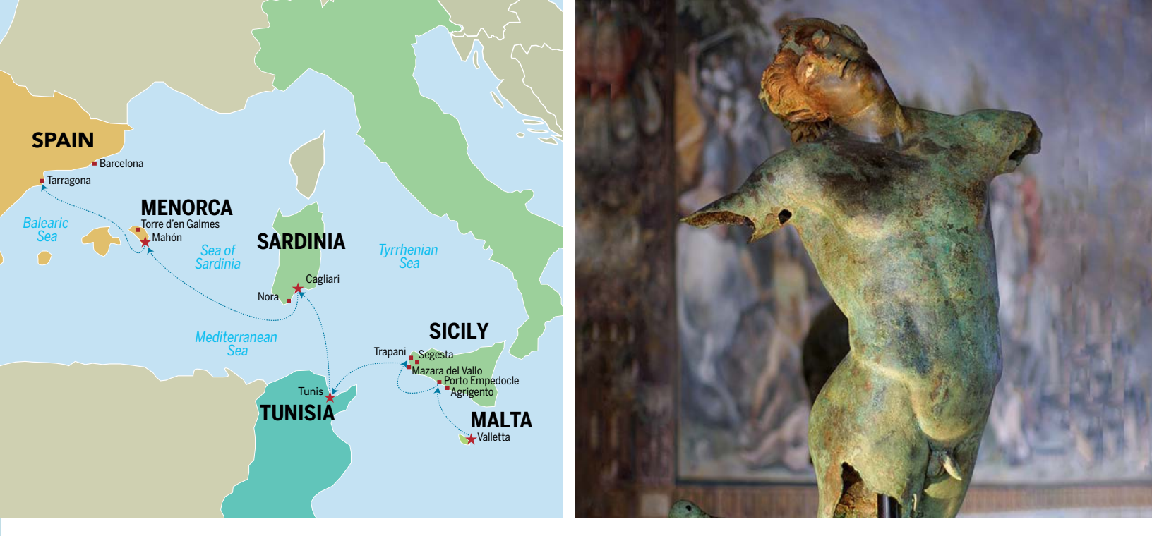
Map of the region (left); The Dancing Satyr, Mazaro del Vallo, Italy (right); Carthage, Tunisia (below left) and the Bardo Museum, Tunis, Tunisia (below right)