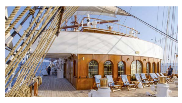
Sea Cloud II Lido Deck

Not Included: International airfare; passport/visa fees; meals not specified; alcoholic beverages other than as noted in inclusions; personal items and expenses; airport transfers other than for those on suggested flights; excess baggage; trip insurance; any other items not specifically mentioned as included.