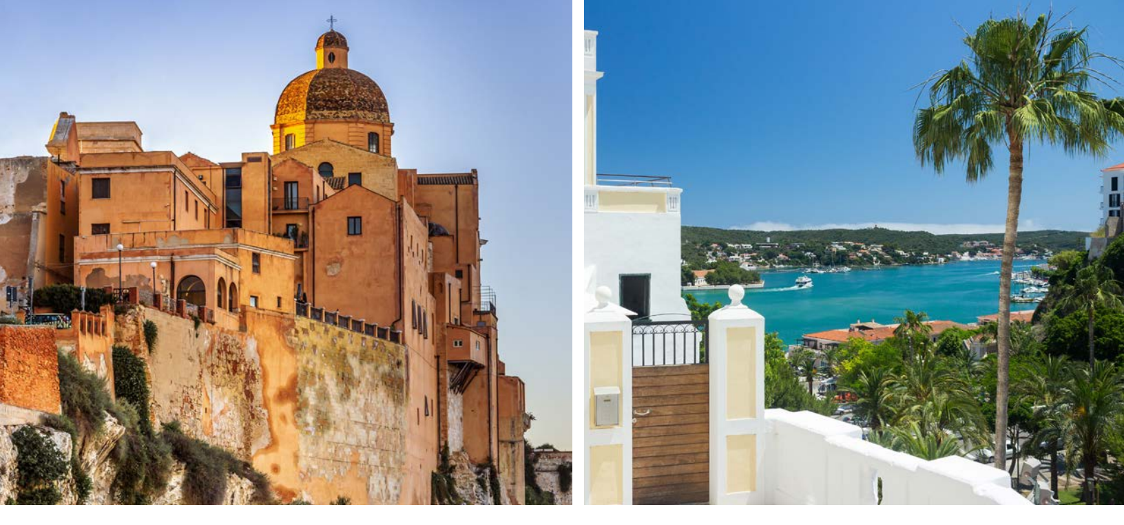
Castello, Cagliari, Sardinia, Italy (left); Mahón, Menorca, Spain (right); Rooftops of Cagliari, Sardinia, Italy (below left) and Talayots, Torre d'en Galmés, Menorca, Spain (below right)