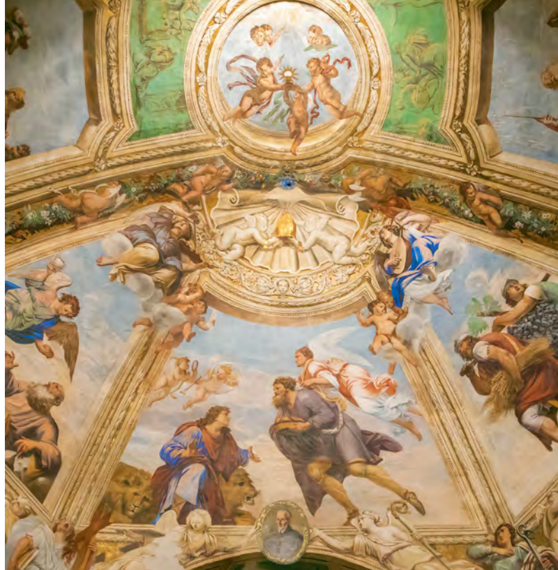
Madonna della Lettera statue, Strait of Messina, Sicily (left); Syracuse Cathedral, Chapel ceiling (detail), Sicily and Roman theater, Syracuse (below left)