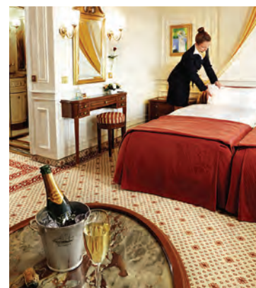
Sea Cloud II Lido Deck (left) and Junior Suite (right)

Trip Registration page: Riace Bronze, Italy (top); and Mt.Etna, Sicily (bottom)