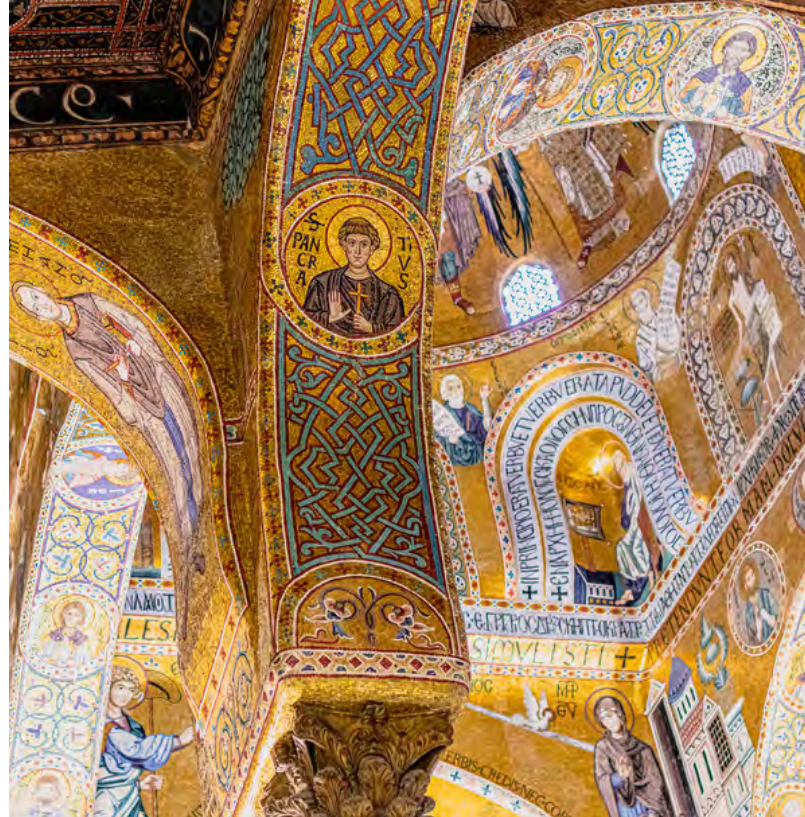
Map of the region (left), Cappella Palatina, Palazzo dei Normanni, Palermo, Sicily (right) and Lipari, Italy (below)