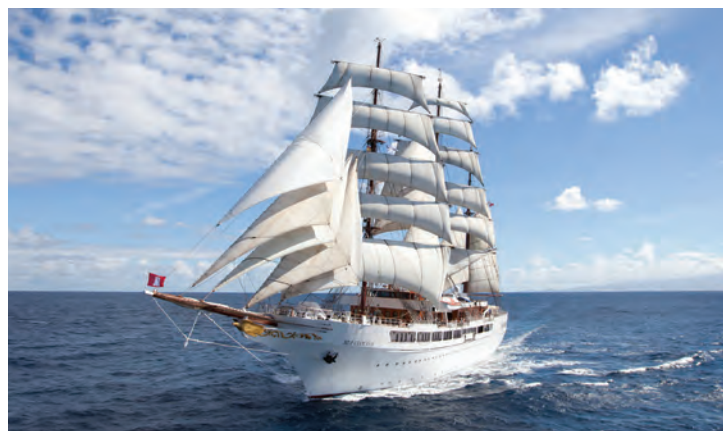
Sea Cloud II

Sea Cloud II is a three-masted sailing yacht steeped in the elegance of yesteryear and complemented with the most modern amenities. Sister ship of the legendary Sea Cloud , Sea Cloud II has 47 outside cabins and travels under 23 billowing sails trimmed by hand. From the mahogany-paneled library and gracious lounge to the gym and watersports platform, no detail has been overlooked. Praised by the world's most discerning travelers, Sea Cloud II receives consistently high rankings from Condé Nast Traveler . Passengers enjoy open seating at all meals and complimentary use of all water sports equipment. A doctor is on call 24 hours a day. Please note: There is no elevator on Sea Cloud II .