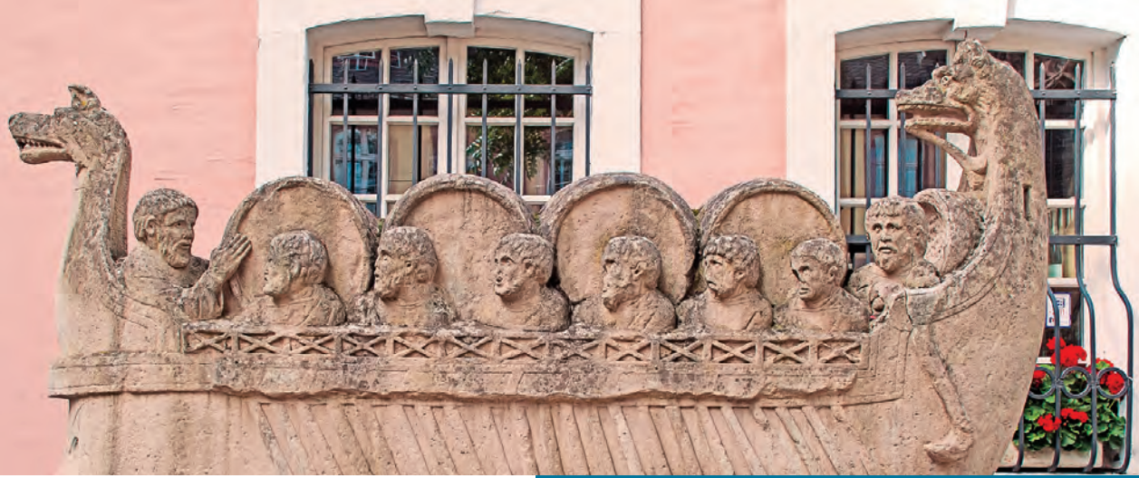
Replica of a Roman statue of a wine merchant's ship from Neumagen, Trier, Germany (above); Saarburg, Germany (below). Front cover: Cochem, Germany, photo courtesy of the GNTQ. Back cover: Cathédrale Saint Étienne of Metz, photo © Phillippe Gisselbeck.