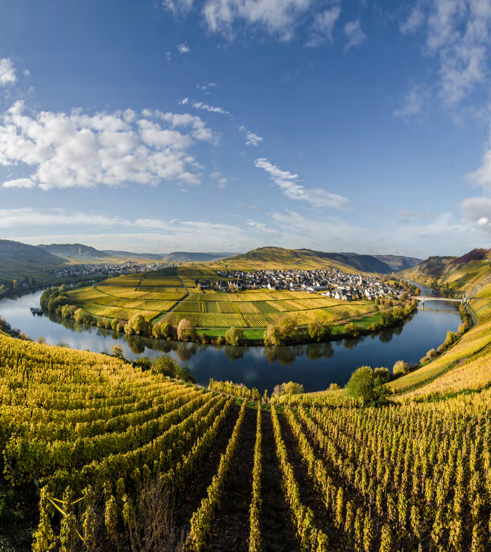
The Moselle Valley