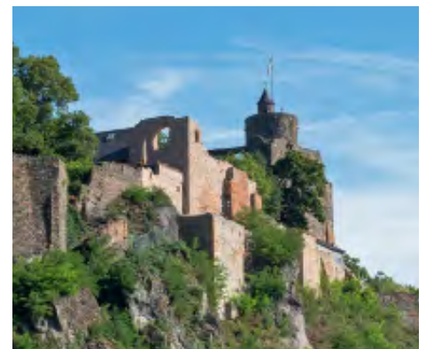
Saarburg Castle, Germany

Following breakfast, transfer to Beilstein, one of the best-preserved historical villages on the Moselle. Explore the medieval ruins of Metternich Castle, which towers above the village. After leaving Beilstein, pass the world's steepest vineyard—with slopes inclining up to 65 degrees—at Bremmer Calmont. Conclude in the wine village of Zell, well-known in the industry for the wine Zeller Schwarze Katz. In Zell, acquaint yourself with the excellent wines of the Moselle valley. B,L,D