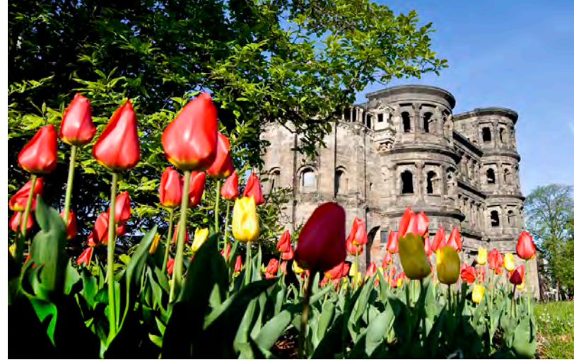
Vineyards in Beilstein, Germany (left) Porta Nigra, Trier, Germany (right)