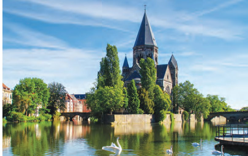
Organ at l'Église Saint-Maximin, Thionville, France (left) and Temple Neuf, Metz (right)