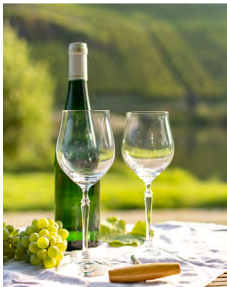
Moselle Valley Reisling

Arrive in Frankfurt, and transfer to Cochem to embark Princesse Royal in the early afternoon. After getting settled, take a guided walk through this cozy Moselle town, with its surrounding vine-clad mountains, wooded hills, and a vividly colorful town square with beautiful timber-framed houses and cafés. L,D