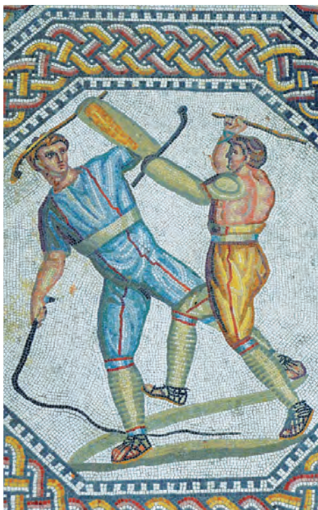
Roman Mosac Nennig, Luxembourg

Today, Princesse Royal sails the section of the Moselle that forms the border between Germany and the tiny country of Luxembourg. On the Luxembourg side, visit a wine cooperative specializing in Crémant , a sparkling wine known as “the Champagne of the Moselle.” Near Remich, admire an ancient mosaic floor that was once the centerpiece of a palatial Roman villa. Composed of three million individual tile pieces, the mosaic floor reveals scenes of gladiatorial combat that would have taken place in local amphitheatres. B,L,D