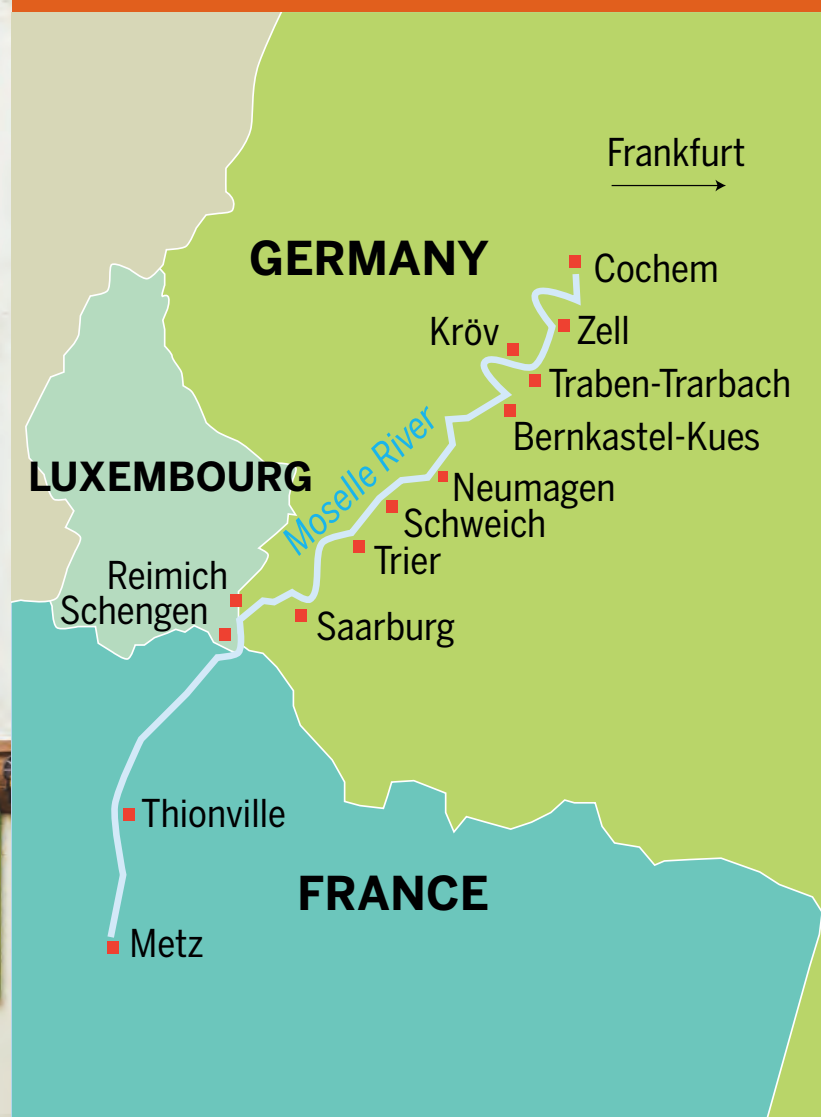
Trier, Germany (left) and map of the region (above)

Step 3: Look for an email confirmation from HAA.