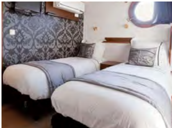
Princesse Royal Lounge (left) and Twin Cabin (right)