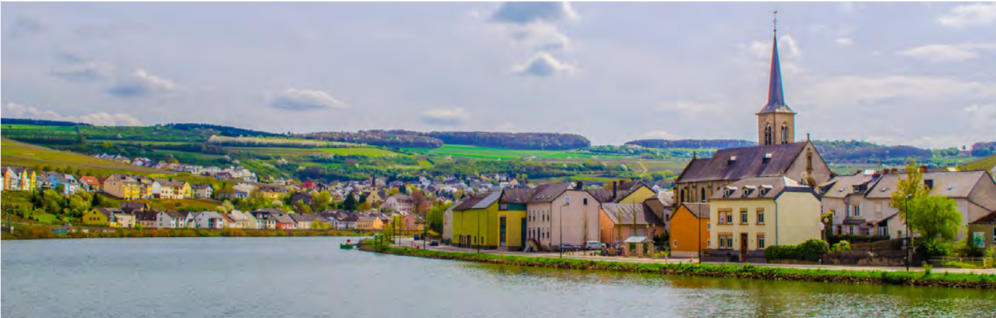
The Moselle flowing through Remich, Luxembourg