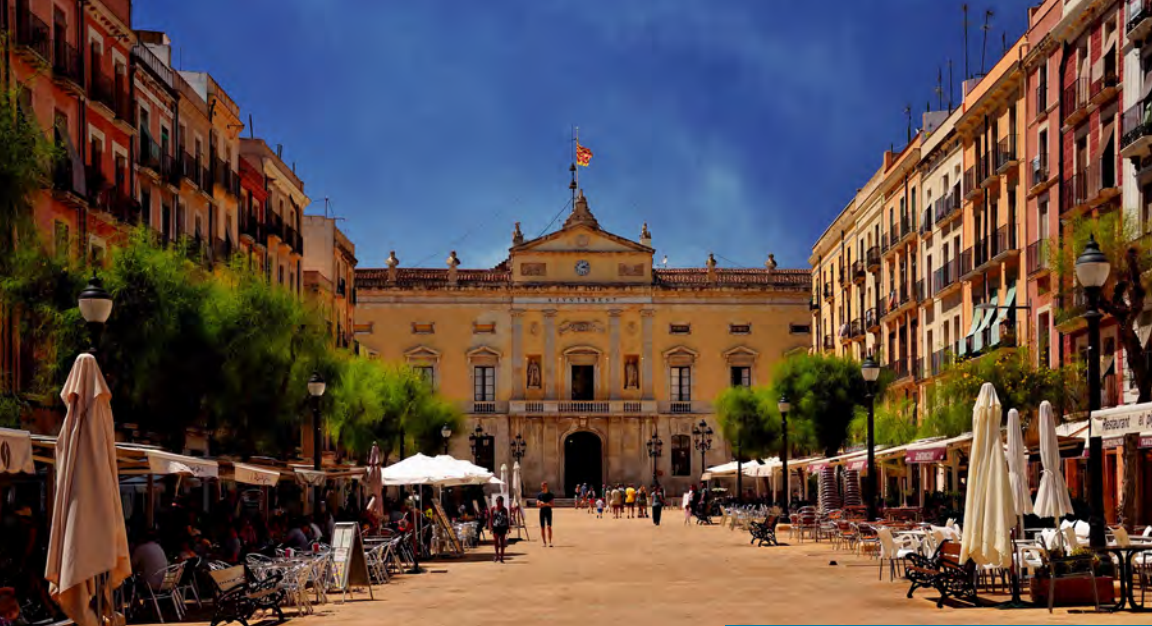
Tarragona (above); Barbary macaques (below right). Front cover: The French Riviera. Back cover: Interior of Notre-Dame de la Garde

The gorgeous Spanish Riviera and Côte d'Azur are dotted with venerable Roman ports and archaeological marvels dating back millennia. Sail the Mediterranean coastline from Cádiz to Nice on the elegant Sea Cloud II , stopping to behold the dazzling masterpieces of art and architecture that inspired everyone from the Phoenicians to Picasso.