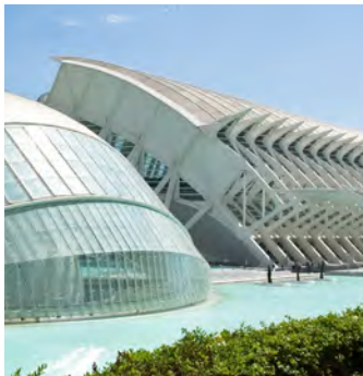
City of Arts and Sciences, Valencia

bridge that formed part of an ancient Roman aqueduct. Then take a guided visit to the Archaeological Museum, founded in the 19th century and host to the remnants of the Roman wall. We will also tour the Roman Circus, where horse and chariot races were held in the 1st century. Later, visit the Roman Amphitheatre, built in the 2nd century and remodeled in 224 A.D. Return to the ship in time for a midnight sailing. B,L,D