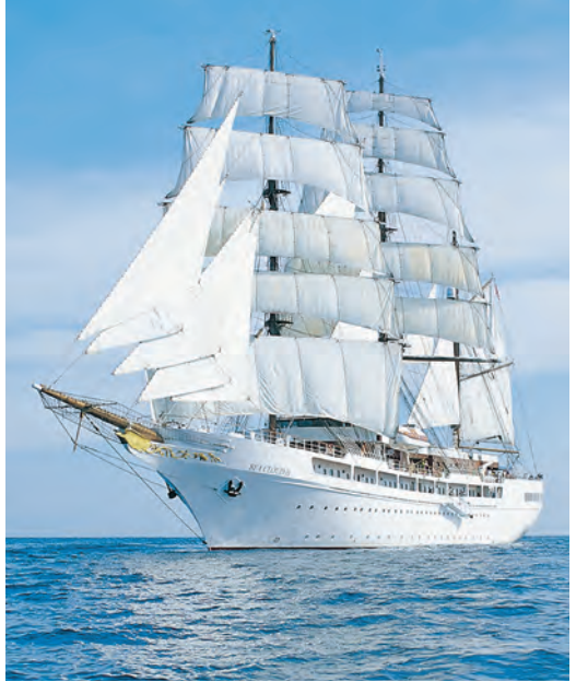
Sea Cloud II

Sea Cloud II is a three-masted sailing yacht steeped in the elegance of yesteryear and complemented with the most modern amenities. Sister ship of the legendary Sea Cloud , Sea Cloud II has 47 outside cabins and travels under 23 billowing sails trimmed by hand. From the mahogany-paneled library and gracious lounge to the fitness area and watersports platform, no detail has been overlooked. Praised by the world's most discerning travelers, Sea Cloud II receives consistent high rankings from Condé Nast Traveler . Passengers enjoy open seating at all meals and complimentary use of all water sports equipment. A doctor is on call 24 hours a day. Please note: there is no elevator on Sea Cloud II .