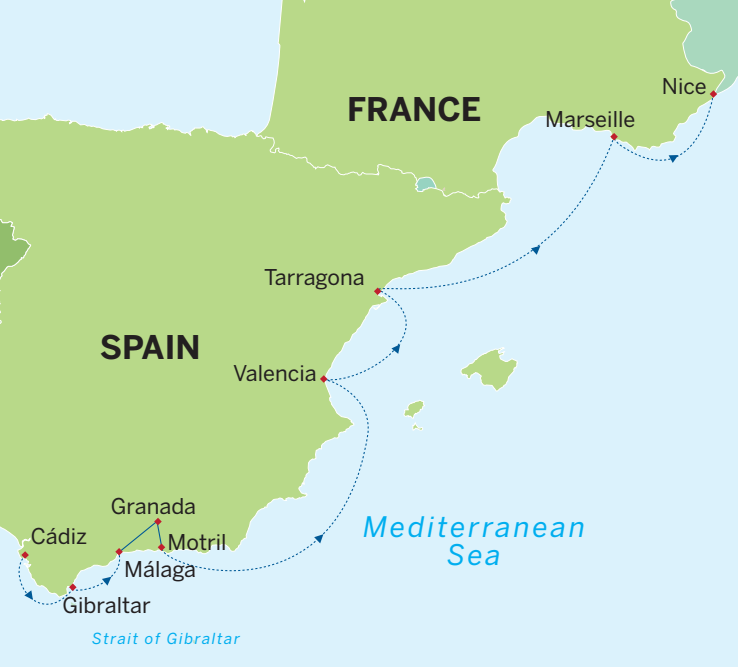
Map of the region (above); Roman vessel, Cádiz (below)