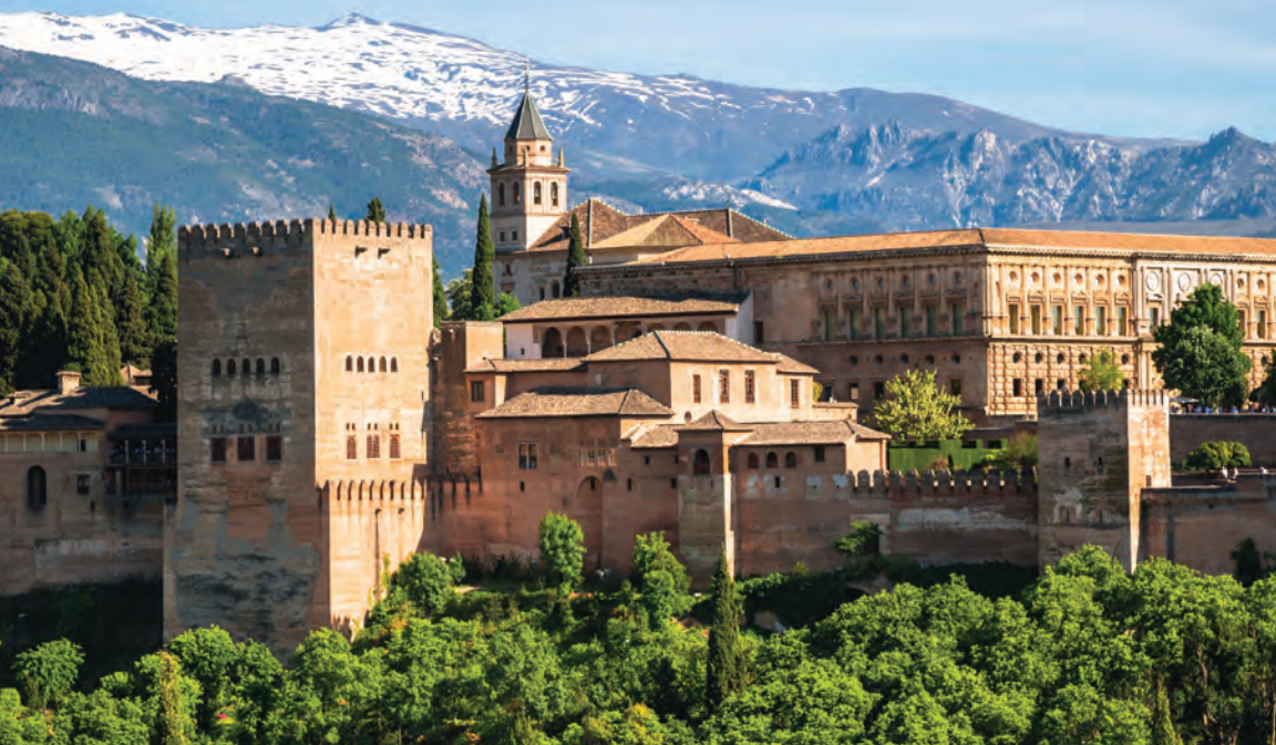
The Alhambra, Granada