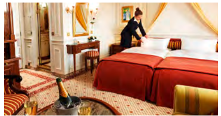
Onboard dining (top) and a Junior Suite (above)