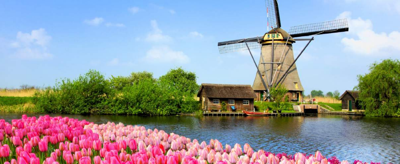
Kinderdijk, Holland (above); Cover: Ghent