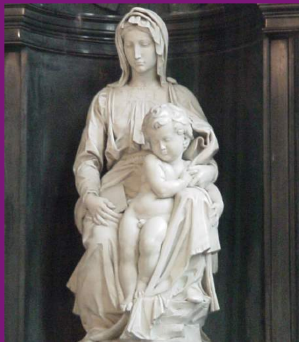
Michelangelo's Madonna & Child, Bruges, Belgium

As this brochure goes to print, we have not yet confirmed the faculty study leader for this program. We intend, however, that you will be joined by a Harvard lecturer who will enhance your travel experience. You will discover that our lecturers are not only first-rate scholars and teachers but also friendly traveling companions, eager to share their insights through conversation as well as in scheduled presentations.