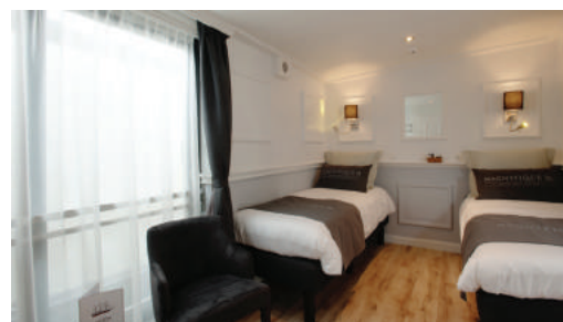
Upper Deck Suite with French Balcony

Suites, twin beds, small sitting area, French balcony with floor-to-ceiling sliding glass doors.