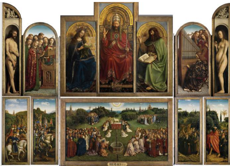
Ghent Altarpiece, Ghent, Belgium (left) and Bruges, Belgium (right)

Disembark after breakfast and transfer to the Brussels airport for flights home. B