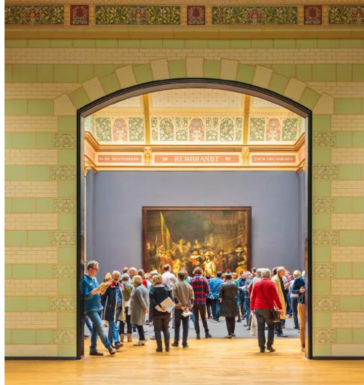
Regional map (left) and Rijksmuseum, Amsterdam, Holland (right)