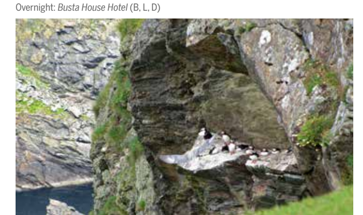
Puffins at Hermaness, Isle of Unst, Shetland Islands.