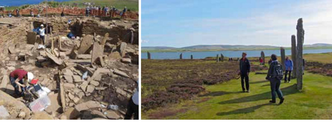
The Cairns excavations, Orkney Islands (left) and Ring of Brodgar, Orkney Islands (right).