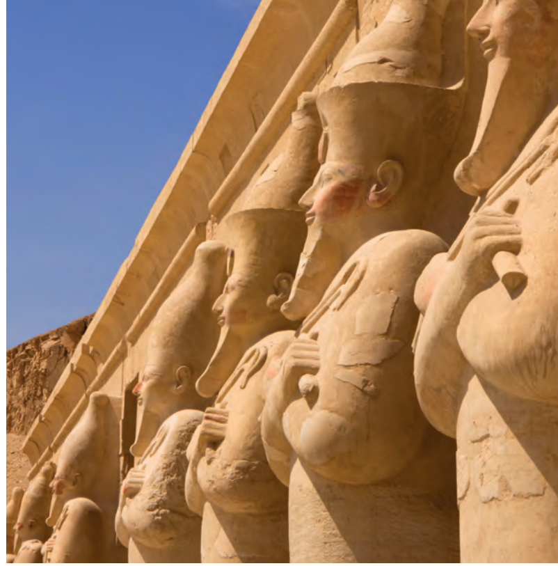
View from a felucca, Aswan (left); Luxor (right) and henna hand painting (below right)