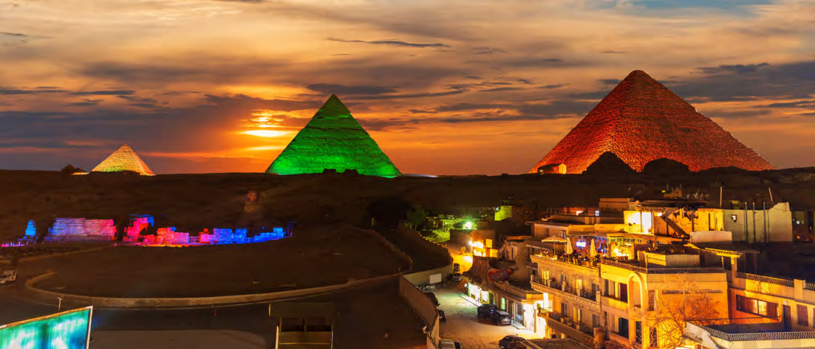
Light show at the Great Pyramids (top) and Relief, Temple of Ramesses II (below)