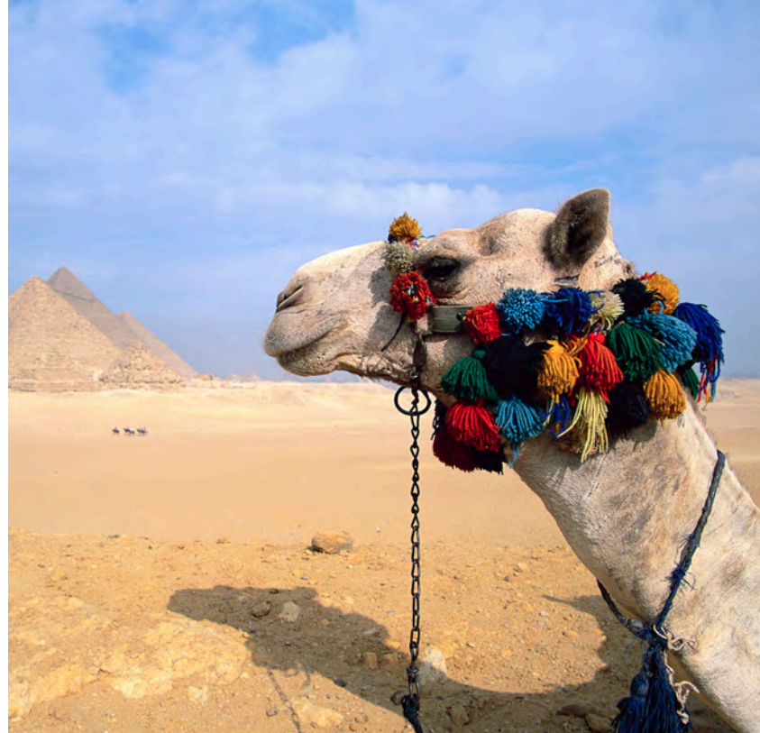
Map of the region (left); Camel at the Great Pyramids (right) and The Great Sphinx (below left) and the Egyptian Museum (below right)