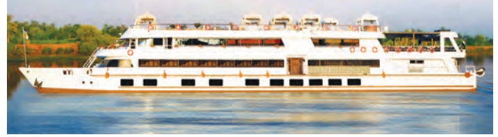
Sanctuary Nile Adventurer

This five-star hotel features three tennis courts, a hot tub, and three swimming pools surrounded by a landscaped garden. All rooms feature decorative touches highlighting Egypt's illustrious heritage. Double rooms with an extra bed ( triple occupancy ) are available.