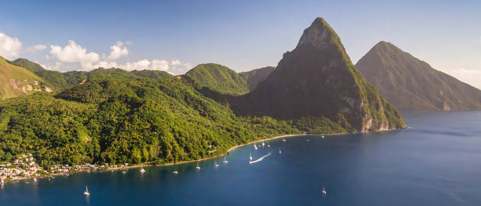
Anse Des Pitons, St. Lucia (above) and Fort Napoléon, Îles des Saintes (below)