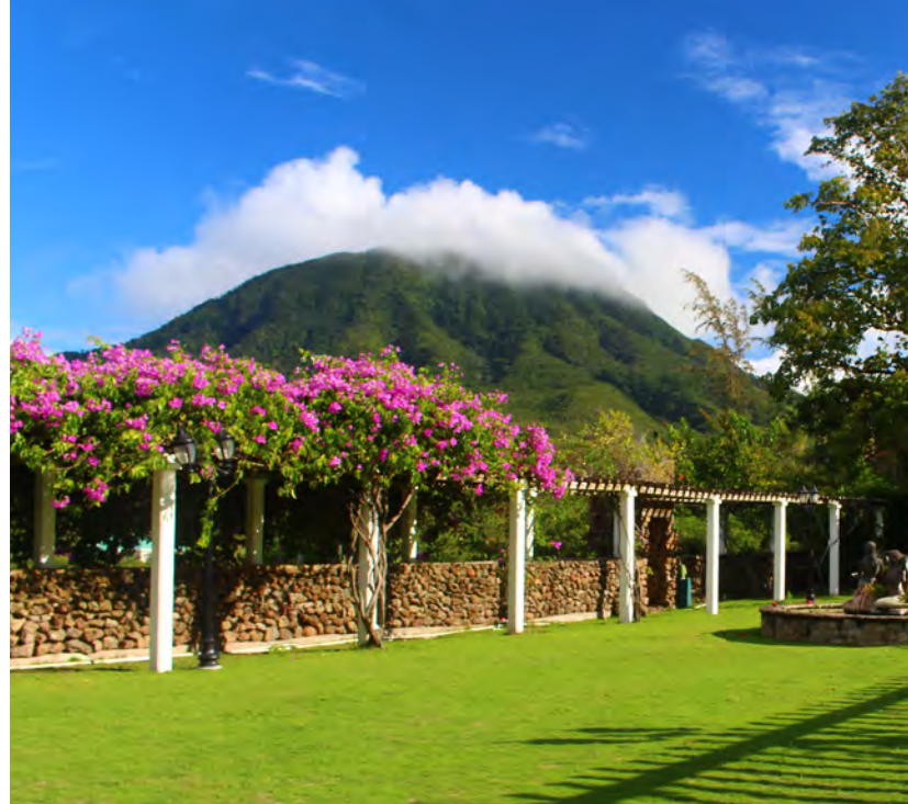
Map of the region (left); Botanical Gardens of Nevis (right); Gustavia, St. Barthélemy (below left) and Botanic Gardens of Nevis (below right)