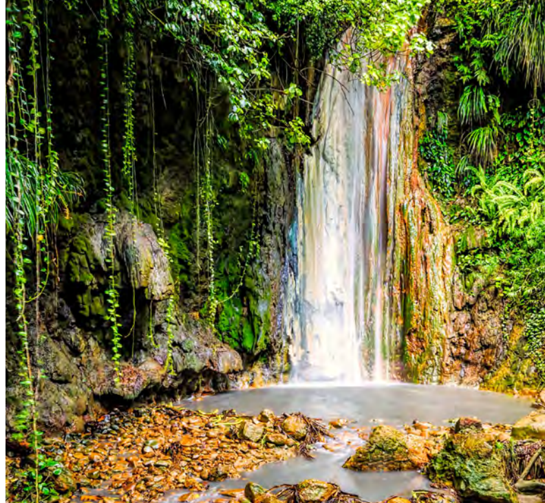
Nelson's Dockyard, Antigua (left) and Diamond Falls Botanical Gardens, St. Lucia (right). Betty's Hope, Antigua (below left); Îles des Saintes (below center); and hummingbird (below right)