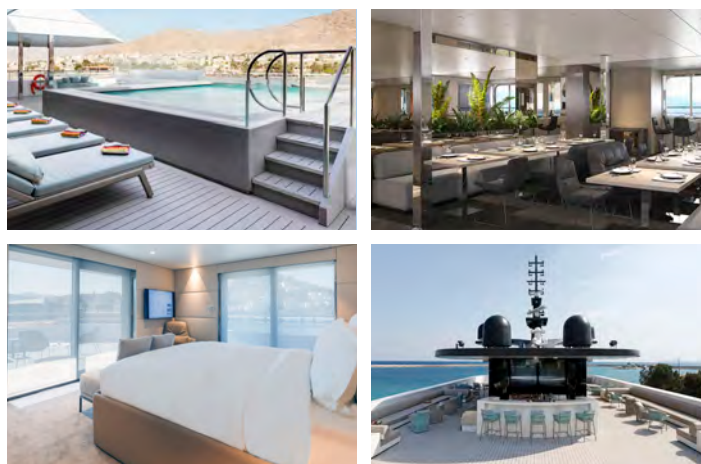
Photos from top left: Pool Deck; Dining Room; Sky Deck; and Yacht Suite

Reaching an impressive 360 feet in length with only 50 cabins, the spectacular new Emerald Azzurra will exceed your yacht cruising expectations. Relax in your spacious, luxurious surroundings. Discover a secluded spot to read a book, enjoy unimpeded views of the unspoiled landscapes, or take a relaxing dip in the infinity-style pool. Expect fresh, locally sourced meals thoughtfully crafted by expert chefs and appreciate the ocean breeze from the large al fresco terrace. Have a nightcap in the plush, relaxed atmosphere of the Horizon Bar & Lounge. Unwind completely in the onboard Wellness Center, where a selection of indulgent spa treatments includes massages, facials, and even a hairdresser. Complimentary Wi-Fi is available for all our guests and a full selection of bikes is on board for your use.