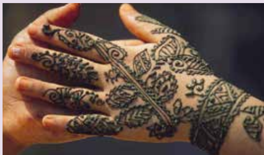
Nubian henna hand-painting