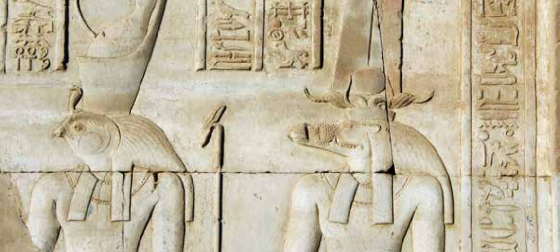
Temple of Horus, Edfu