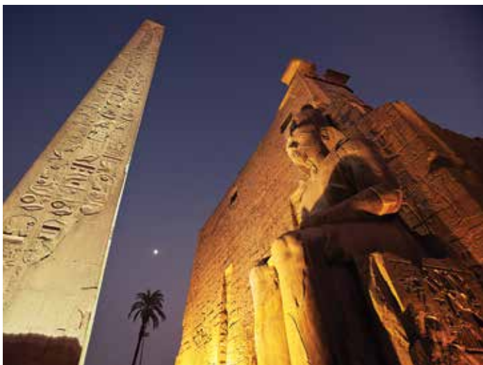
Luxor Temple

Step ashore this morning in Edfu to travel by horse and cart to the exceptionally well-preserved Temple of Horus, whose reliefs still retain some of their original colors. Lunch is