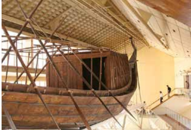
Sanctuary Nile Adventurer pool (left) and Solar Boat Museum, Giza, (right)