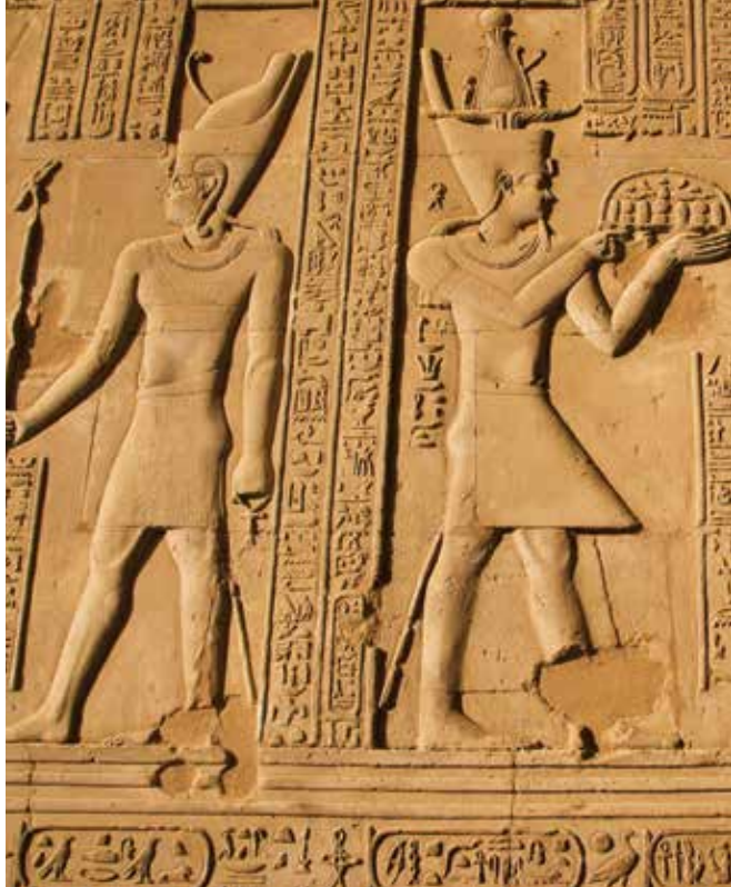
Kom Ombo temple, Edfu

on board while you cruise along the Nile. Guests of all ages can learn how to bake Egyptian-style bread during a cooking class. In the late afternoon, visit Kom Ombo's picturesque Ptolemaic temple, dedicated to the crocodile god Sobek and decorated with a series of beautiful reliefs. Tonight savor a buffet of Egyptian specialties, and dress up in traditional clothing for a festive night of music and dancing. B,L,D