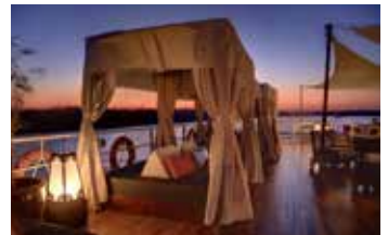
Sanctuary Nile Adventurer lounge (top); Suite (center); Sun Deck (above)

TO BOOK A TRIP, CALL 800-422-1636 OR VISIT ALUMNI.HARVARD.EDU/TRAVEL