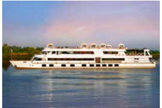
Sanctuary Nile Adventurer

With a sleek contemporary design and only 32 cabins, Sanctuary Nile Adventurer offers a mix of intimacy and luxury. This elegant riverboat features a sun deck with swimming pool and private cabanas, and a shaded deck with an outdoor bar. All cabins offer Nile River views.