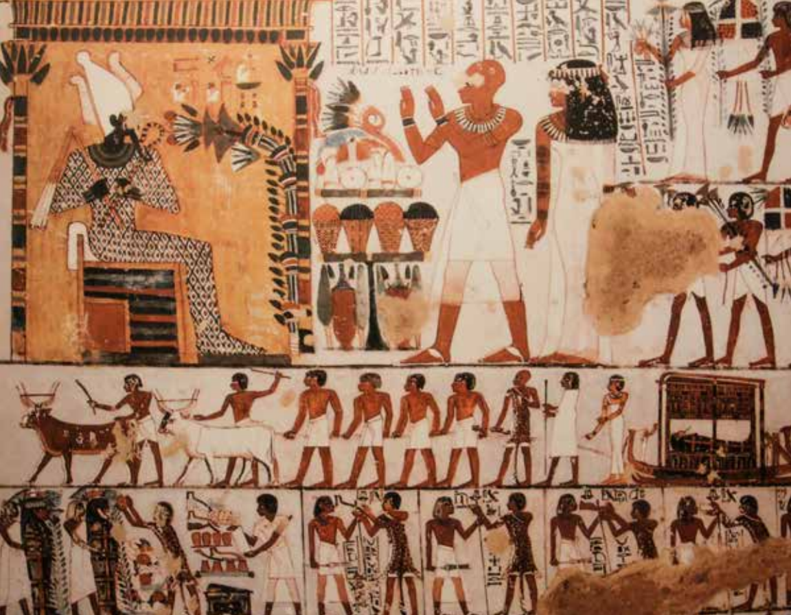
Tomb of Tutankhamun, Luxor (above). Front cover image: the Great Pyramids, Giza. Back cover image: The Sphinx, Giza.