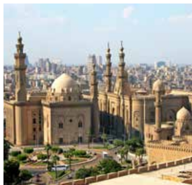
Feluccas on the Nile (top) and Cairo (above)