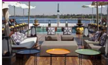
Sanctuary Nile Adventurer Sun Deck