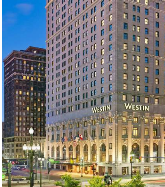
Westin Book Cadillac Hotel