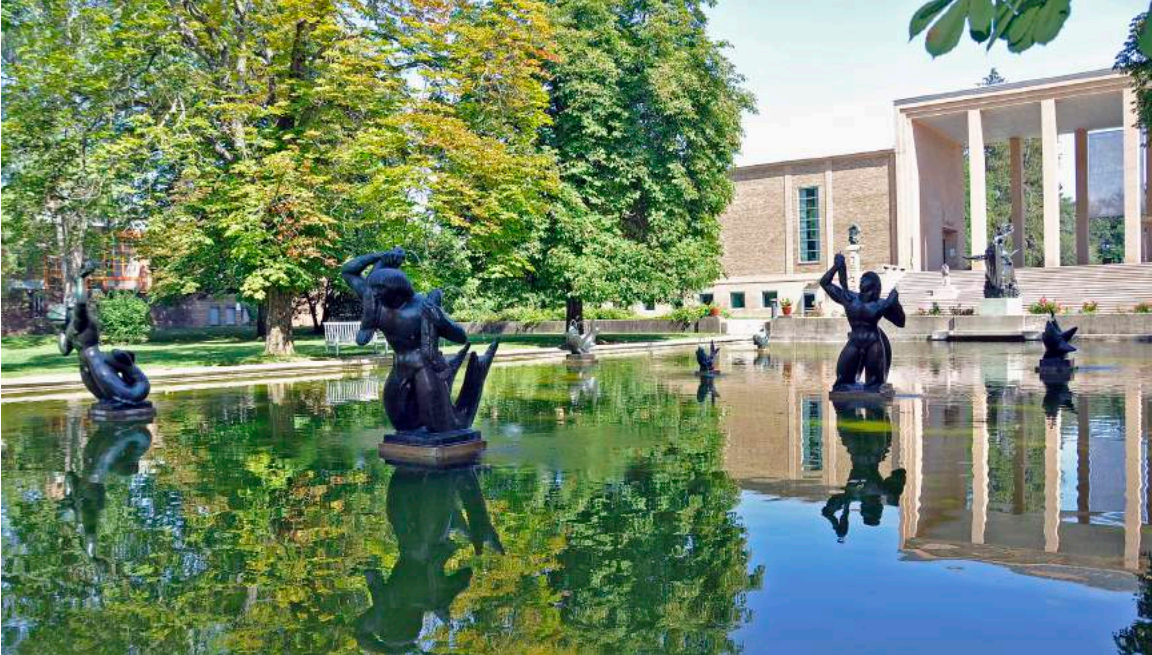
Cranbrook Art Museum

Greenfield Village, part of the Henry Ford Museum and a reconstruction of life in the early days of America. Wander its 80 acres to find working 19th-century farms, an operating steam-powered rail, and a reproduction of Thomas Edison's Menlo Park laboratory. Your evening will be at leisure. B,L