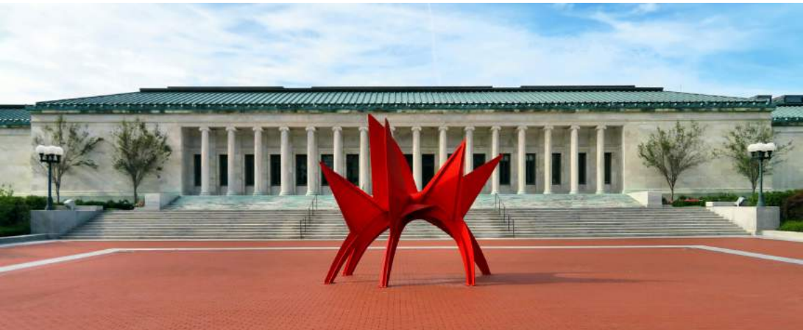
Toledo Museum of Art (above) and Saarinen House living room