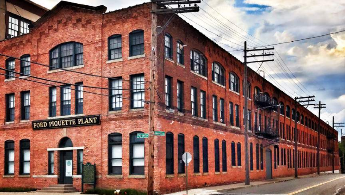
Ford Piquette Avenue Plant