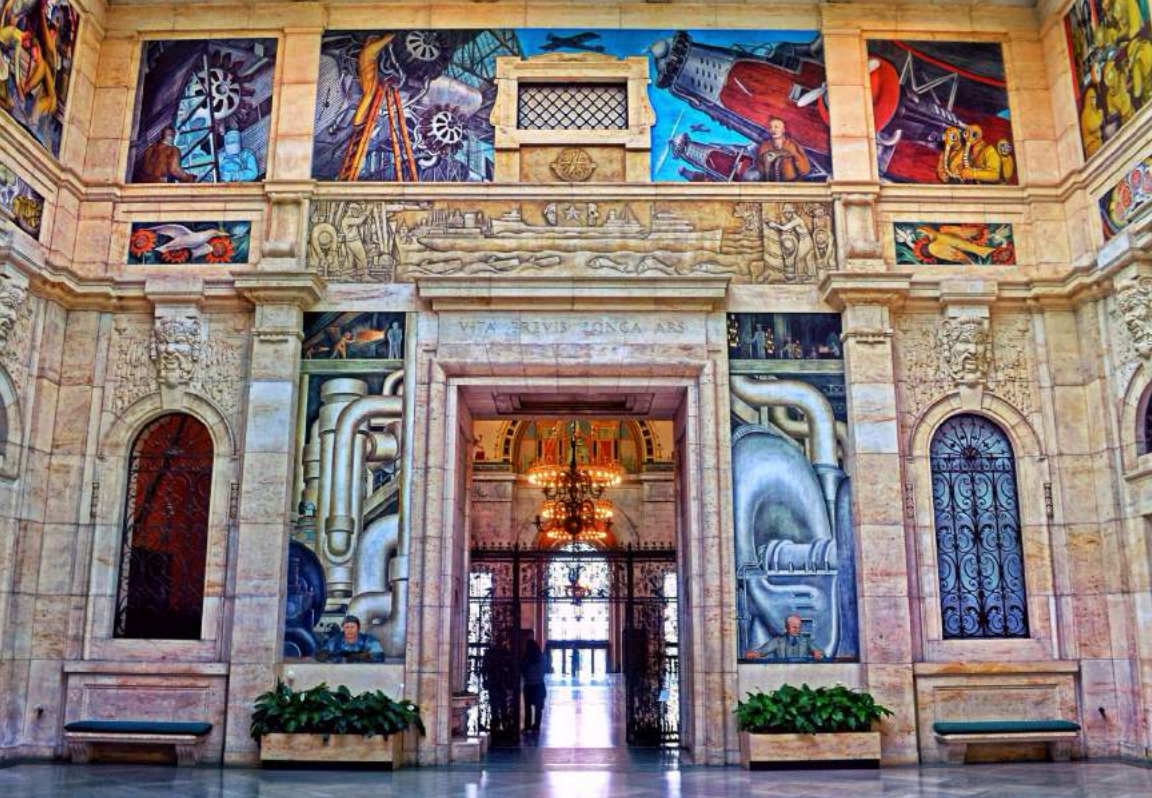
Detroit Institute of Arts