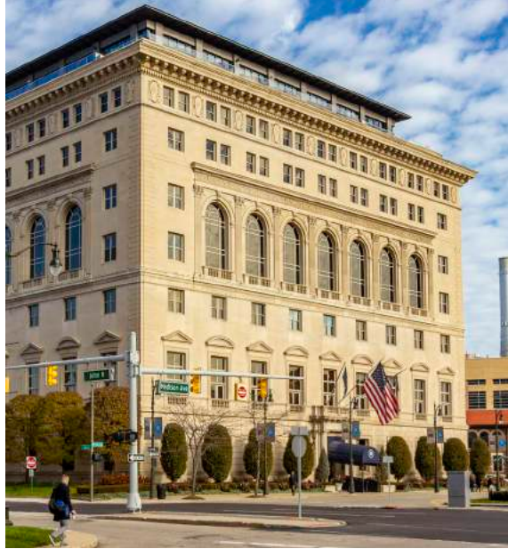
Detroit Athletic Club