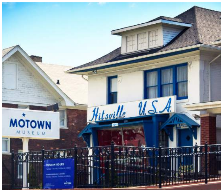
Hitsville U.S.A.

Today, drive to Toledo to revel in a private tour of the Toledo Museum of Art with a curator. The Toledo Museum is considered one of the finest in the country, with more than 30,000 pieces in its permanent collection, including a famous assemblage of glass objects in its Glass Pavilion. After lunch, travel back to Detroit. In nearby Dearborn, explore fascinating