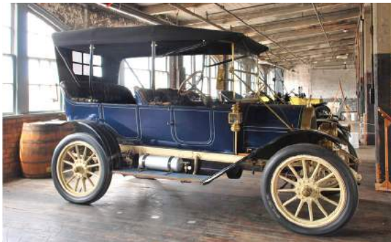
1912 Overland Touring Car, Ford Piquette Avenue Plant, © Steve Brown

TO BOOK A TRIP, CALL 800-422-1636 OR VISIT ALUMNI.HARVARD.EDU/TRAVEL