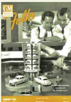
1950 GM Midcentury Motorama Model