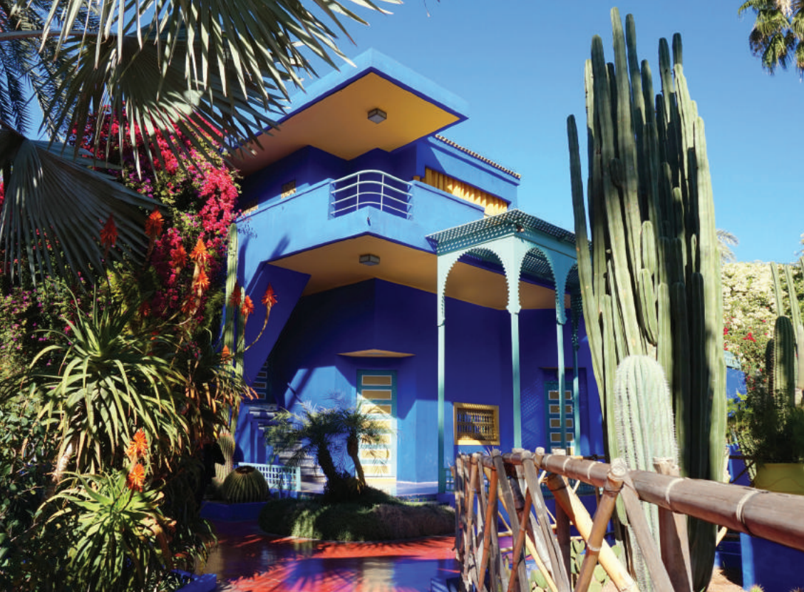
Villa Oasis, Marrakesh