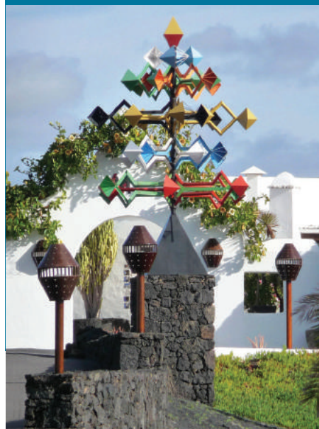
César Manrique Foundation, Arrecife