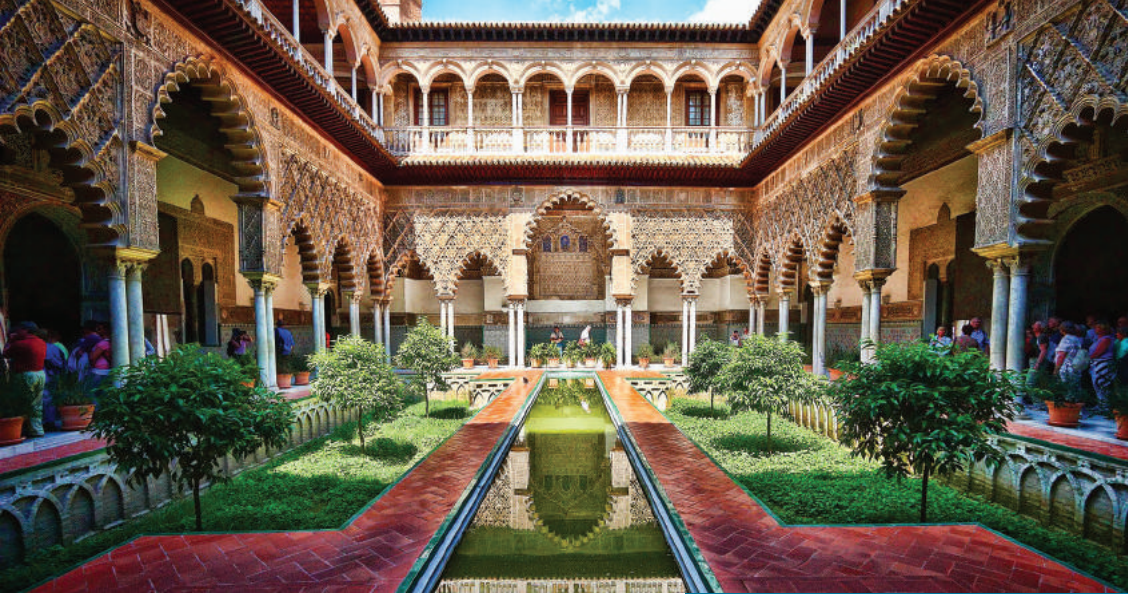
Alcázar, Seville (above). Front cover image: Hassan II Mosque, Casablanca. Back cover image: Djemaa el-Fna Square, Marrakesh.

The fortunes and histories of the Canary Islands, Northern Africa, and the Iberian Peninsula have been intertwined for centuries. Aboard the intimate Sea Spirit , sail from the Canaries to Madeira to Morocco, Spain, and Portugal to discover how these vastly different cultures merged and diverged over time.