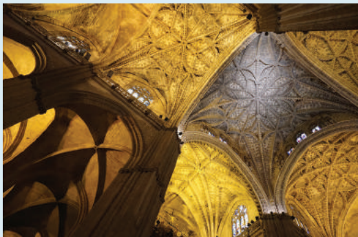
Seville Cathedral