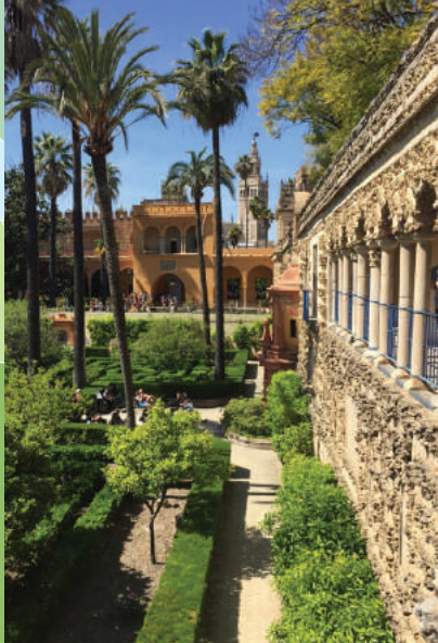
Murillo Gardens, Seville