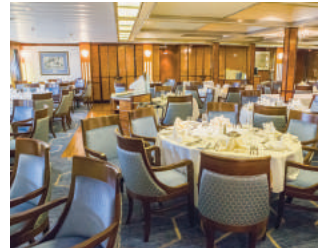
Sea Spirit Premium Suite (top); Lounge (above)