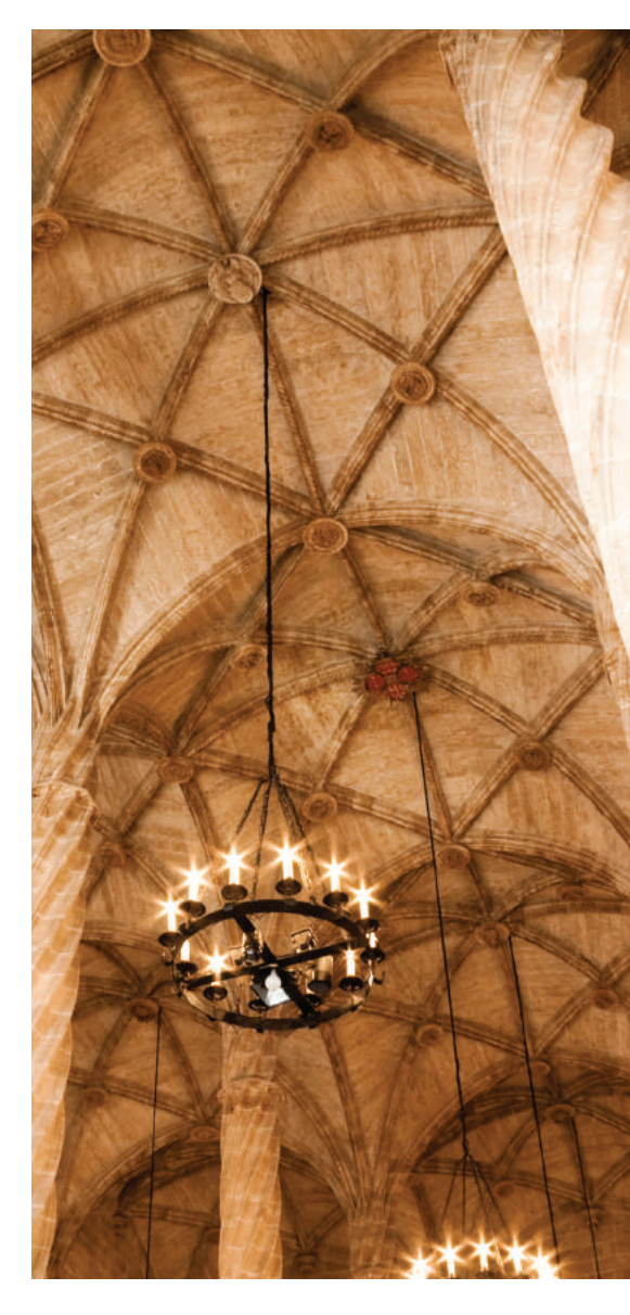
Lonja de la Seda, Valencia (above)

Disembark Sea Cloud II upon return to Tarragona this morning and transfer to the Barcelona airport for your flights home.