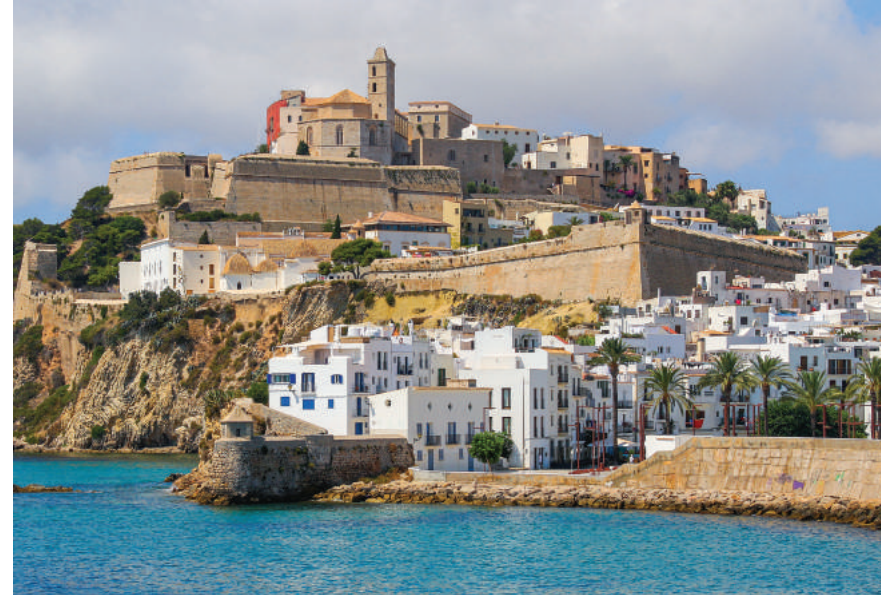
Mercado Central, Valencia (left) and Dalt Vila, Ibiza Town (right)

You will also visit the Mercado Central (Central Market), an exemplary showcase of Valencian Art Nouveau, where more than 300 stalls overflow with local delights. See the spectacular Gothic Valencia Cathedral, whose architecture ranges from Romanesque to Neoclassical. Within, visit the Chapel of the Holy Chalice, housing a first-century A.D. cup believed to have touched Christ's lips during the Last Supper. Before returning to the ship, discover the Museo de Bellas Artes de Valencia, Spain's second-largest art gallery, whose collection includes treasures by Velázquez, Goya, and Sorolla. Alternatively, marvel at the futuristic Ciudad de las Artes y las Ciencias, designed by Valencia-born architect Santiago Calatrava, with its six magnificent structures and a distinctive bridge. B,L,D