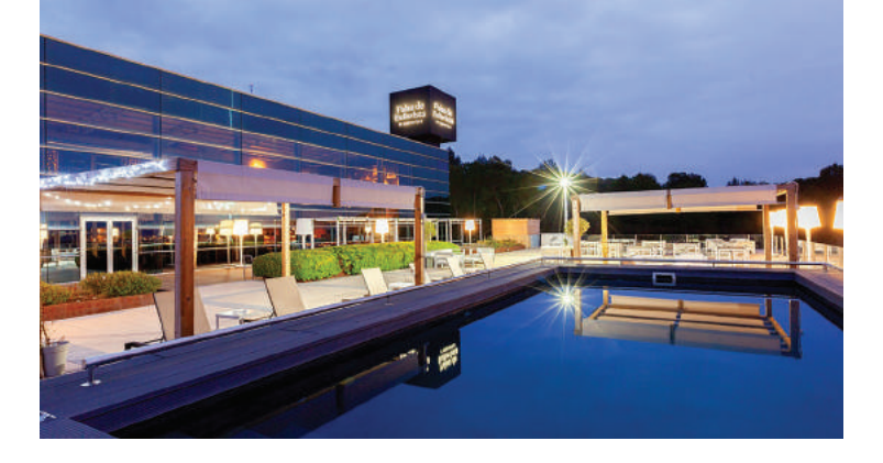
Hotel Palau de Bellavista Girona

This elegant hotel sits in a quiet corner next to Girona's Jewish quarter and Barri Vell (the historic old town). Combining chic design with impeccable service, the Hotel Palau de Bellavista features great views from the hotel's roof terrace as well as a bar and a pool.