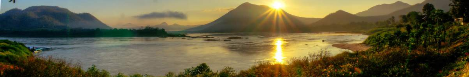
Mekong River (above); Front cover: Pak Ou Caves, Laos. Back cover: Elephant Sanctuary, Pakbeng (top) and Luang Prabang (bottom).