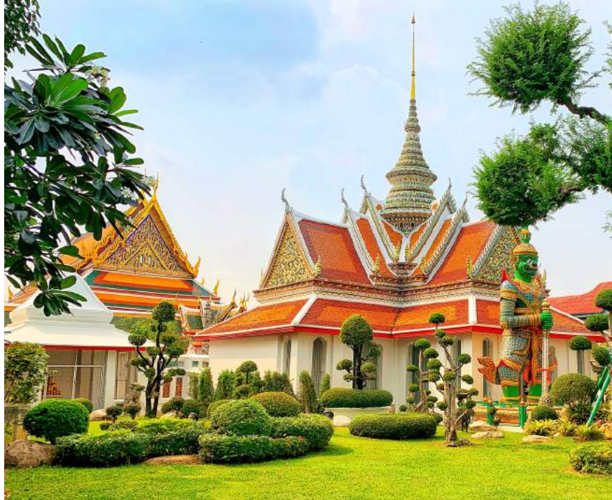
Wat Phra Singh, Chiang Rai, (left) and Grand Palace, Bangkok, (right)