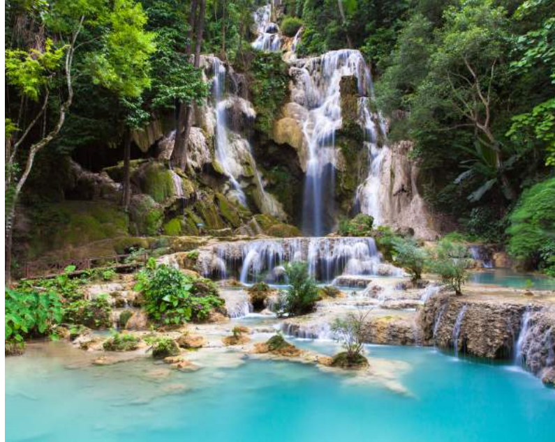
Wat Xieng Thong, Luang Prabang (left) and Kuang Si Falls, Luang Prabang (right)