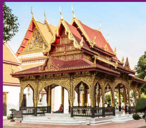
Bangkok Museum, Bangkok

in establishing geospatial analysis support for teaching and research and became the inaugural director of the Center for Geographic Analysis in 2005. Additionally, he leads two significant projects in collaboration with other institutions: the China Historical Geographic Information Systems project with Fudan University, which aims to create a GIS covering 2,000 years of Chinese history; and the China Biographical Database project with Academia Sinica and Peking University. The latter is an online relational database currently comprising 420,000 historical figures, with plans to include all biographical data from China's historical record spanning the last 2,000 years. During his tenure as Vice Provost from 2013 to 2018, he oversaw HarvardX, the Harvard Initiative in Learning and Teaching, and research that bridges online and residential learning. Working alongside William Kirby, he also co-teaches several HarvardX courses related to China. His lecture topics for this upcoming travel program will be announced closer to departure.