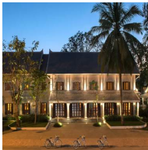
Avani+ Luang Prabang Hotel

On the banks of the Chao Phraya River, this elegant five-star hotel offers a mix of traditional Thai style and modern comfort. Amenities at the Peninsula include a pool, spa, fitness center, tennis courts, and several restaurants and bars.