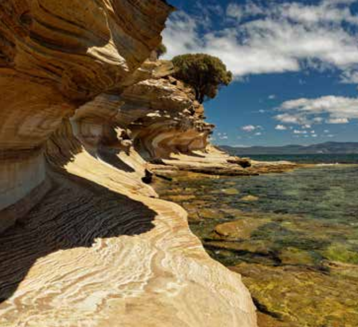
Painted Cliffs, Maria Island