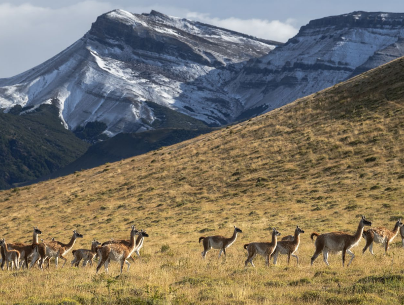
Torres del Paine