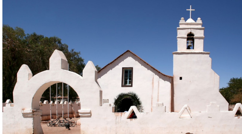
Flamingos at Salar de Atacama; Atacama Church in Calama.