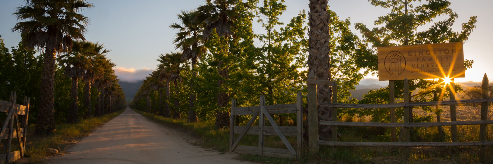
Kingston Family Vineyards entrance