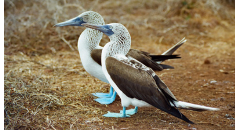
A curious marine iguana; Courting Blue-footed Boobies