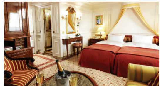
Sea Cloud II Lido Deck (top) and Junior Suite (above)