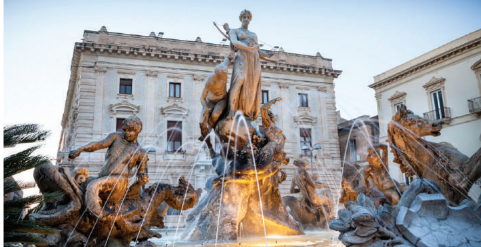
Map of the region (left) and Fountain of Diana, Syracuse (right)