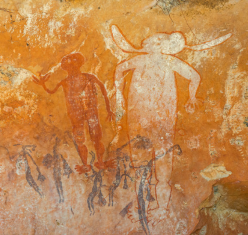
Above: Aboriginal rock art Cover: "Diamond ring effect" just before totality