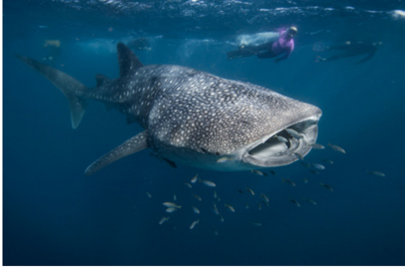
Left: Kalbarri National Park; Right: Swimming with a Whale Shark