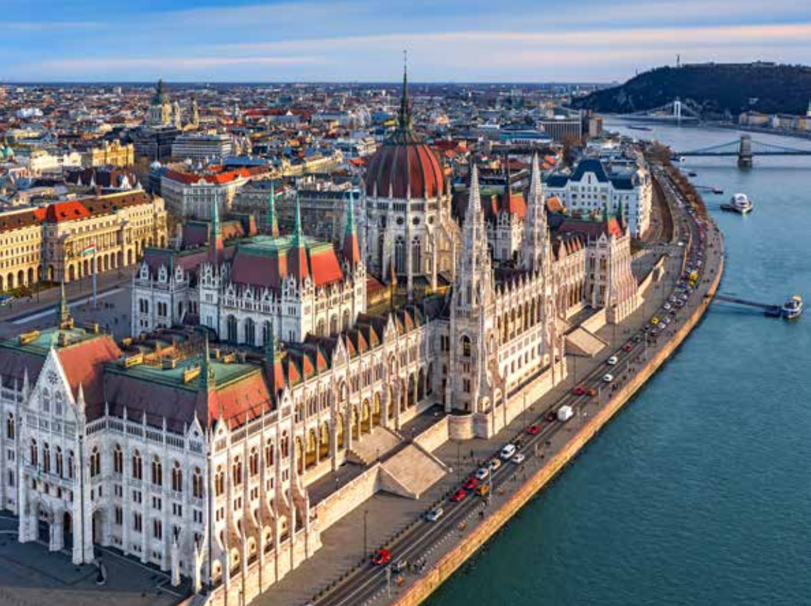
Hungary's Parliament Building in Budapest, towers over the river.