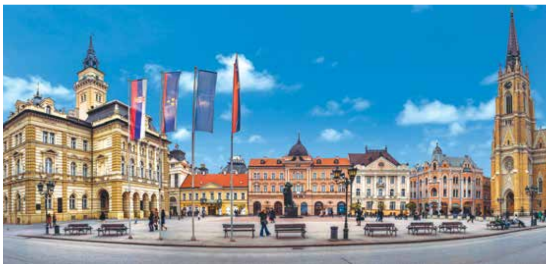
Walk through the Freedom Square of Novi Sad admiring the 18th and 19th century architecture.

Visit Arbanasi's perfectly preserved Konstantsaliev House and the 15th-century Birth