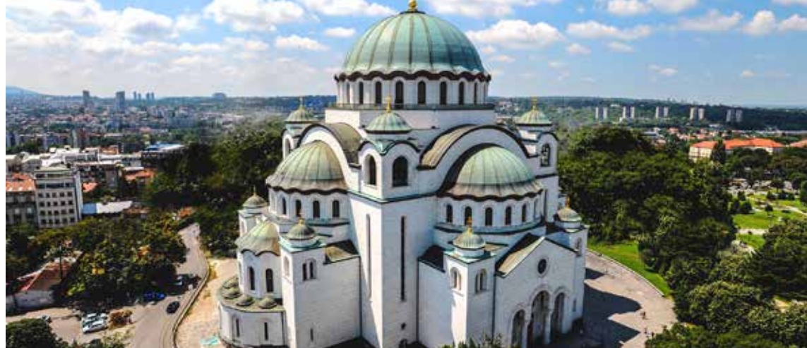
Visit the Church of St. Sava, Serbia's patron saint.

Visit the Baroque Church of Saints Philip and James. Enjoy a walking tour of Novi Sad's Old Town to see the Name of Mary Church, Town Hall and the 18th-century Petrovaradin Fortress, Europe's second largest fortress.