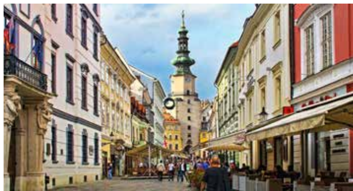
St. Michael's Gate is the only remaining intact portion of the city's medieval fortifications.

Enjoy a scenic drive through Hungary's scenic, protected Puszta grassland plains and visit a horse farm to see a performance of Hungarian horsemanship. Enjoy a traditional lunch in the farm's restaurant. Continue to Kalocsa to visit the House of Folk Art and Paprika Museum. (B,L,D)