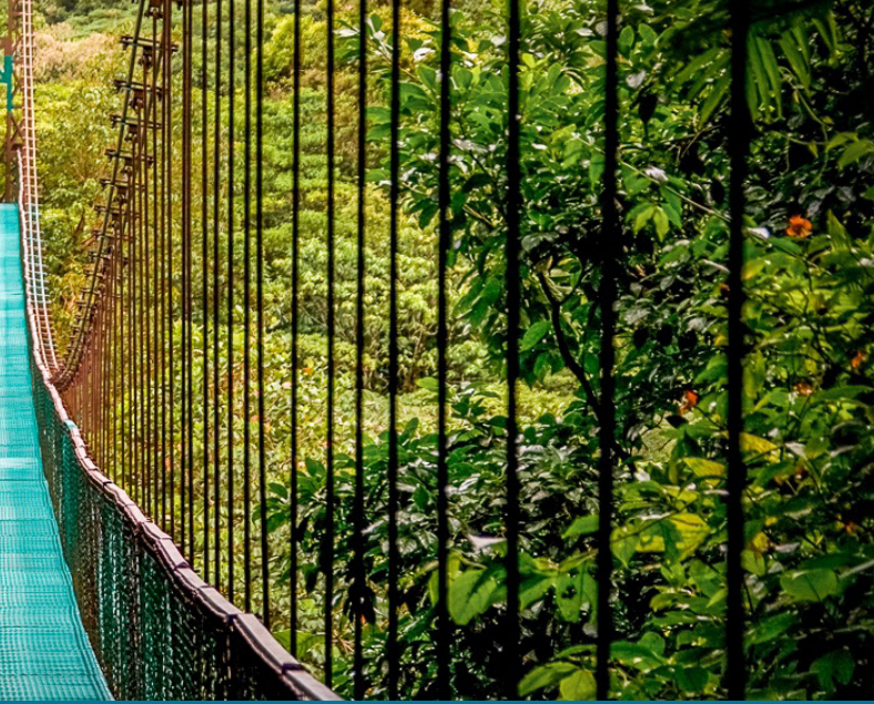
Hanging Bridges in Cloudforest, Monteverde

A cooking class will provide insights into local, organic family farming and agriculture in the tropics, with a focus on delicious regional cuisine and specialties. Benefit from the expertise of an exceptional lecture team and local guides throughout our experience. Please note that this exclusive Harvard Alumni Travels opportunity is limited to 30 spots. Secure your reservation now for an unforgettable exploration