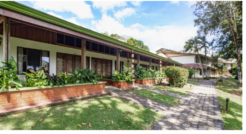
Tilajari Hotel, Arenal