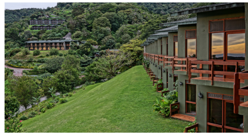
El Establo Monteverde