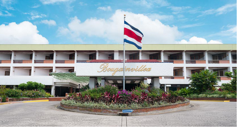
Bougainvillea Hotel, San Jose