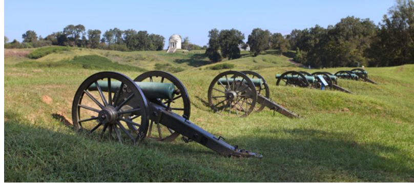
Left Photo: New Orleans' Garden District / Right Photo: Vicksburg National Military Park