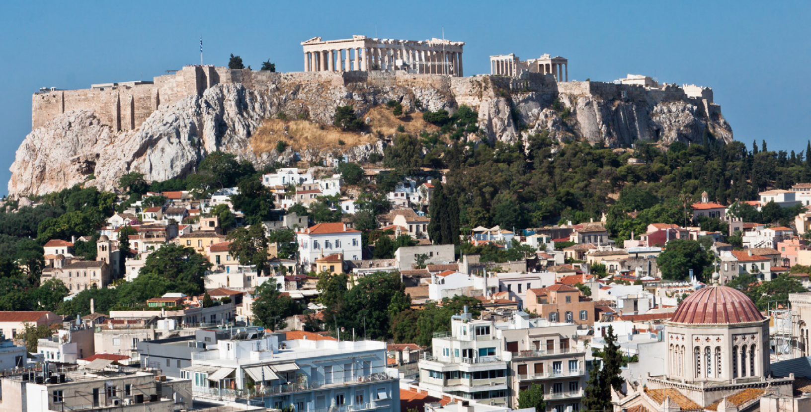
The Acropolis in Athens