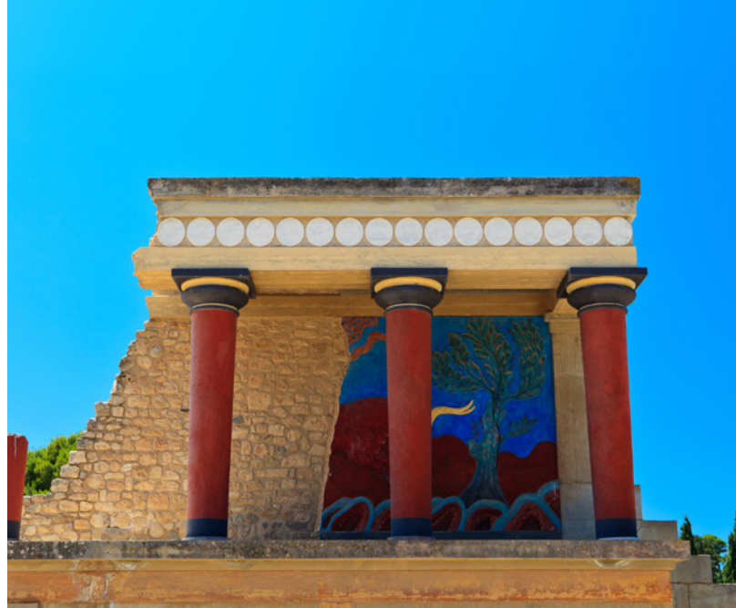
Left photo: Mada'in Saleh / Left Photo: Knossos