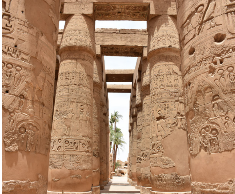
Right photo: Karnak-Pillars of Great Hypostyle Hall