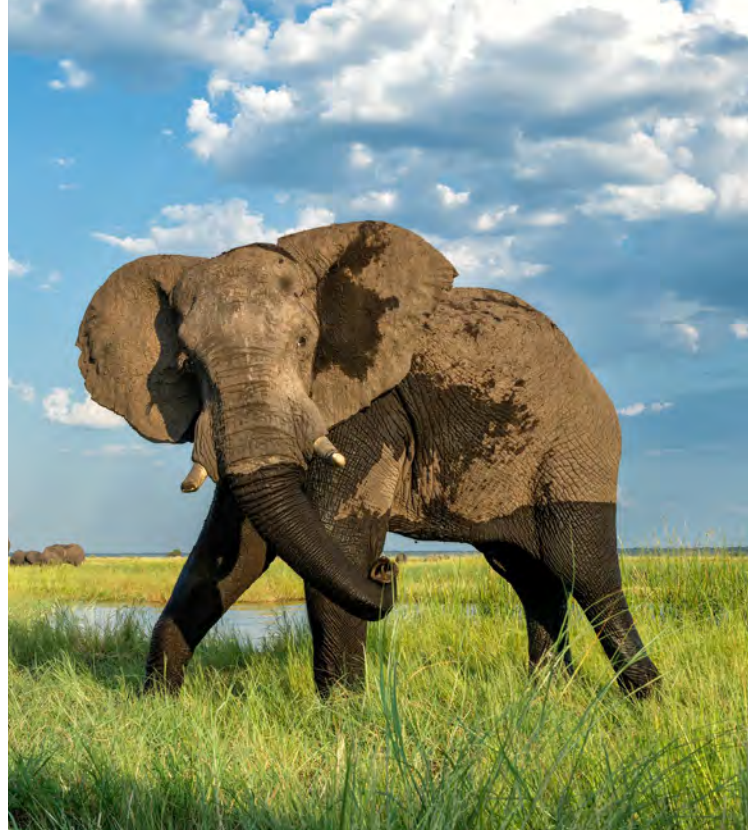
Close encounter with an elephant from a boat at the Chobe River.