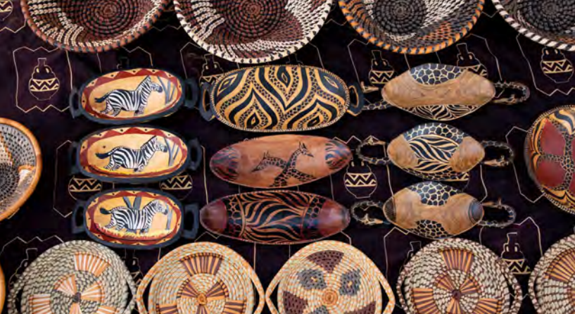
Artistry of handcrafted wooden bowls.