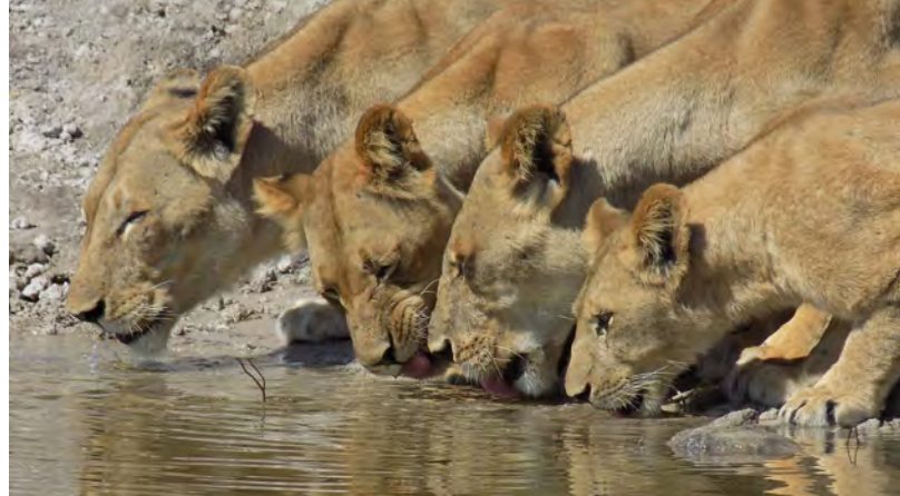
Young lions drink from the Chobe river.