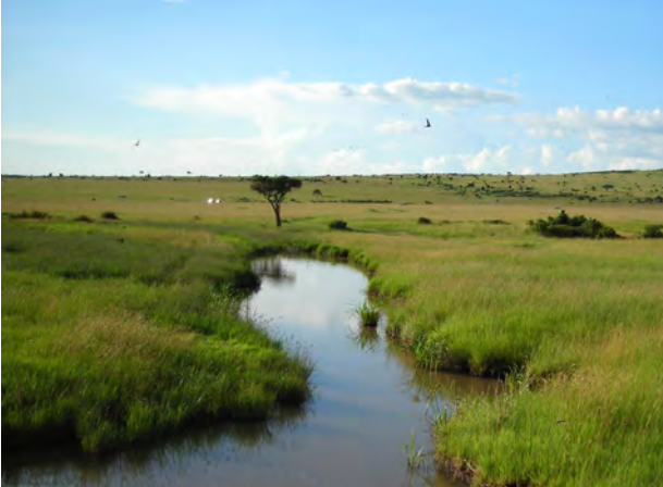
Views from the Zambezi Queen.