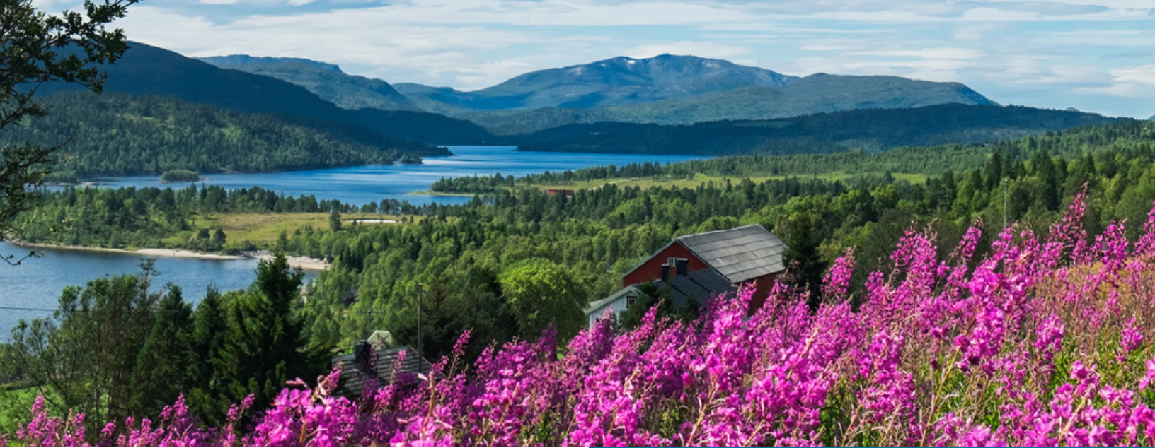
Flowers of Norway