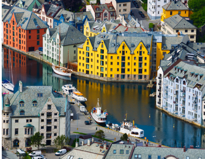
Left photo: Viking Ship Wood Carving / Right photo: Ålesund, Norway