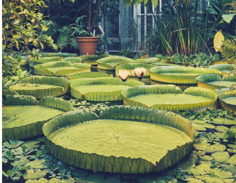
Left photo: Balmoral Castle / Right photo: Giant Water Lilies—Oslo Botanical Garden, Norway