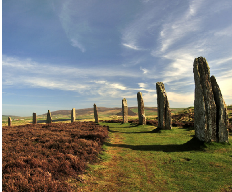
Right photo: Ring of Brodgar