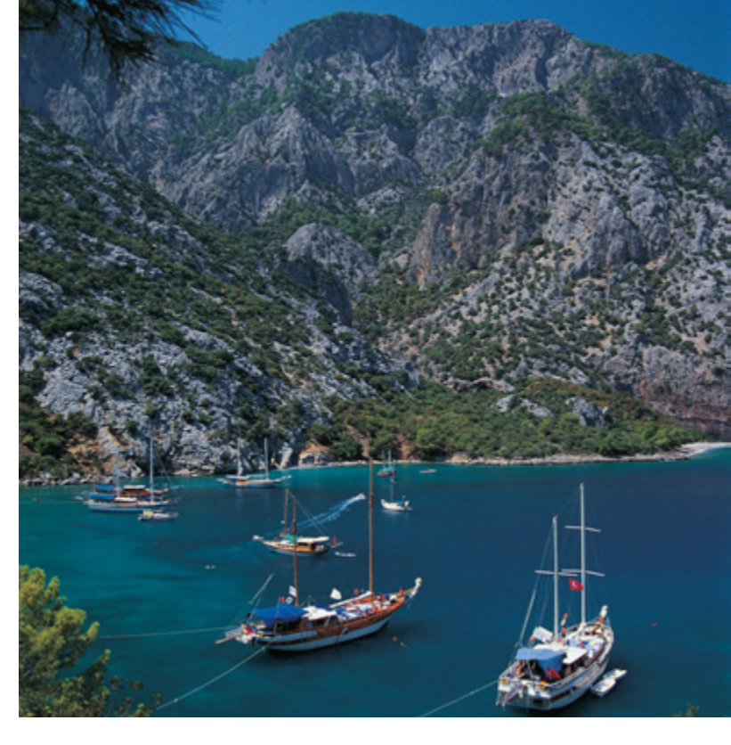
Inside Hagia Sophia; Gulets at anchor