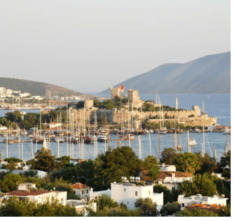
The Castle of St. Peter in Bodrum, surrounded by the harbor; An ancient Roman road in Ephesus