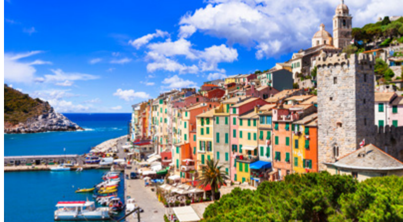
Saint-Paul-de-Vence; Porto Venere