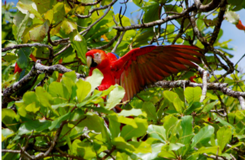
Left: Beach at Corcovado National Park; Right: Macaw in the trees