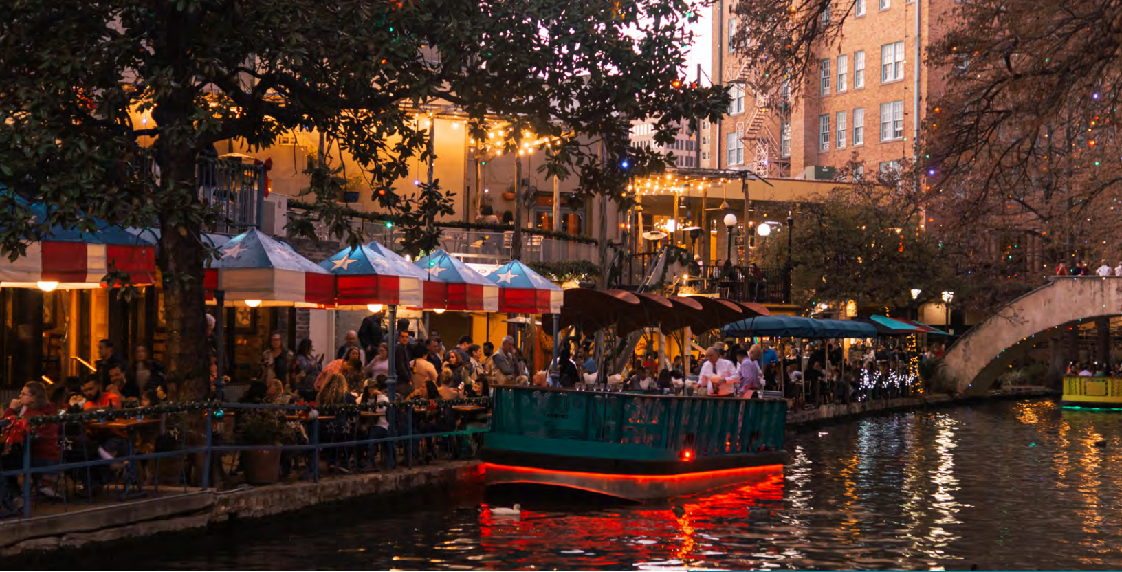
Riverwalk, San Antonio