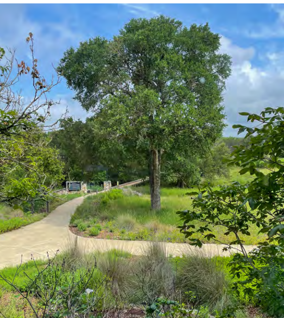
Photos (Top to Bottom): Bluebonnets, Total Solar Eclipse, Lady Bird Johnson Wildflower Center.

PROGRAM NOTE: The Texas Hill Country will be a prime location to experience the Great American Total Solar Eclipse on April 8, 2024. We will provide an optimal viewing location to experience this phenomenon. Please keep in mind that because viewing the total solar eclipse will be weather dependent, there is always a chance that passengers will not be able to view it or view it only for a short period of time. Neither Royal Adventures nor the Harvard Alumni Association makes any guarantees as to the viewing of the total solar eclipse.