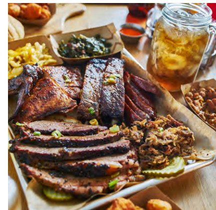
Barrel Racing performer; Big horn cattle; portrait of Lady Bird Johnson; San Antonio skyline, Texas; Texas barbeque lunch