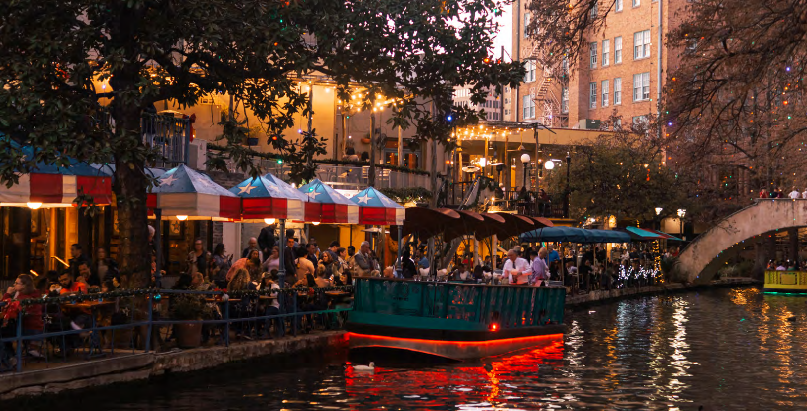
Riverwalk, San Antonio