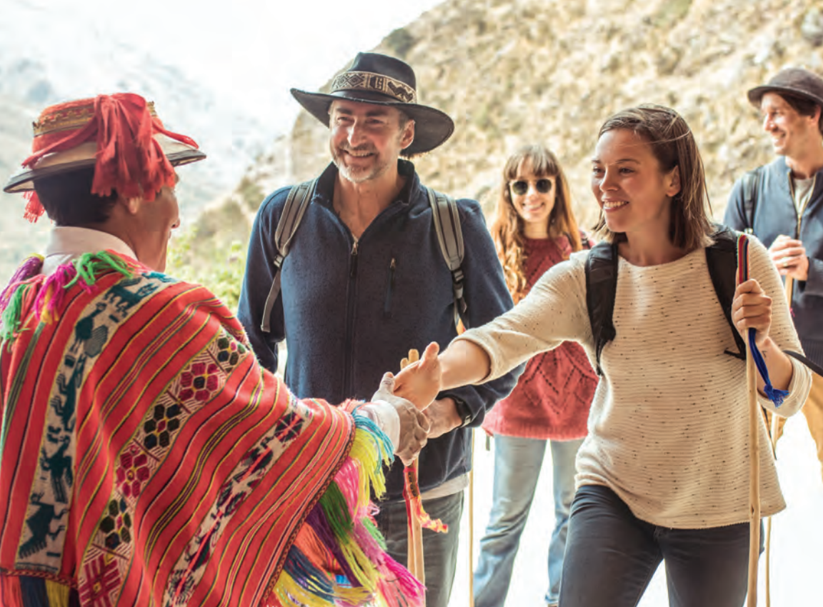
Arriving back to the Huacahuasi Lodge after a hike

Join us on a journey to Peru through the rich history, living culture, and magnificent Andean landscapes of the Sacred Valley of the Incas. We'll travel on a lodge-to-lodge adventure to majestic archaeological sites that lead to remote and uncrowded trails abounding in natural beauty and dotted with Andean communities. Our expert guides will tailor your experience with an offer of á la carte activities to suit your physical abilities and desires for each morning's excursion. Daily activities include natural and cultural encounters that range from easy, moderate, or challenging hiking options to cooking lessons, mountain biking, or visiting an ancient weaver's village. Our journey culminates at the enchanting site of Machu Picchu; walk to the Gate of the Sun, and even climb the dramatic peak of Huayna Picchu. On our return, we will visit the center of the Incan universe, Cusco, and explore the bohemian quarter of San Blas with its cobblestone streets and Incan walls. We've taken care of the planning and logistics, including expert leadership, so you can enjoy a unique lodge-to-lodge adventure to remote hiking routes, archeological sites, and authentic cultural encounters.