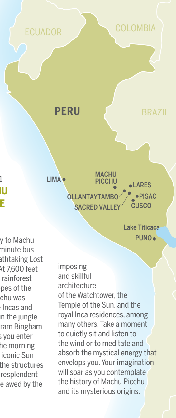
Macchu Picchu; Cooking class

imposing and skillful architecture of the Watchtower, the Temple of the Sun, and the royal Inca residences, among many others. Take a moment to quietly sit and listen to the wind or to meditate and absorb the mystical energy that envelops you. Your imagination will soar as you contemplate the history of Machu Picchu and its mysterious origins.