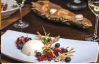
The Singular; bedroom at Vira Vira; dessert at Vira Vira