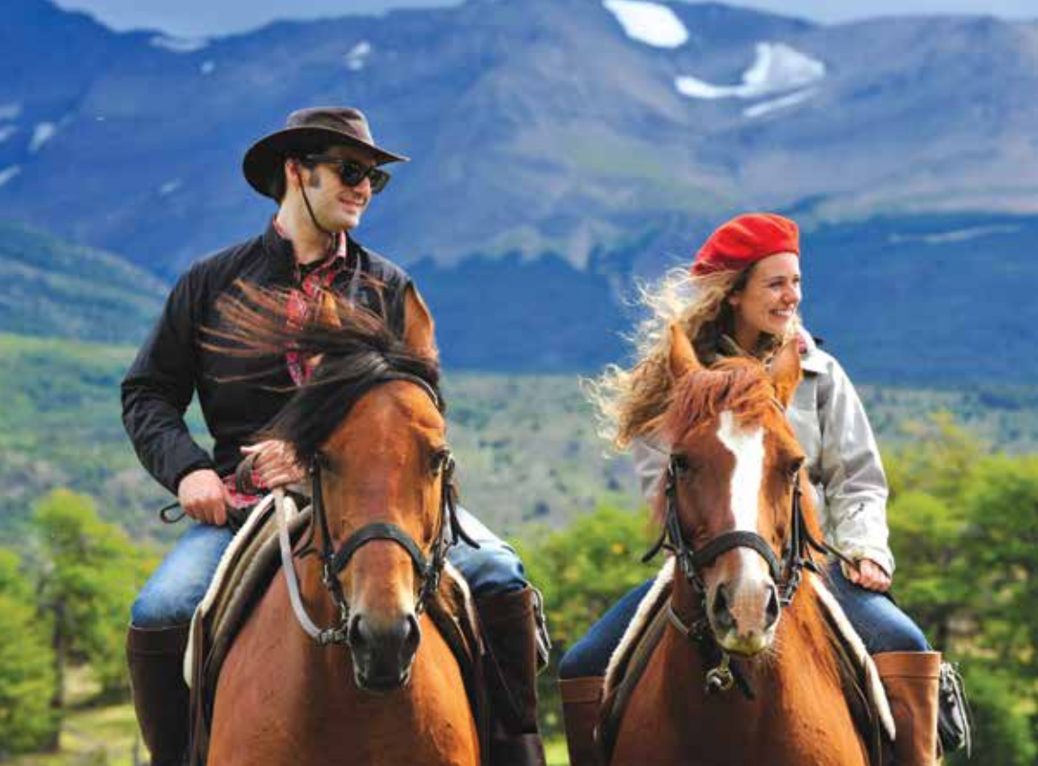
Horseback riding; (below right) Mountain biking in the Lake District

On this exclusive HBS journey, embark on a captivating 12-day journey through the vast, pristine wilderness of Patagonia. After touring the vibrant metropolis of Santiago, head south to Chile's Patagonian Lake District, a region of snow-capped volcanoes, crystal clear lakes and mystic forests. Your first stop will be Pucón and the lovely Vira Vira lodge. Choose from tailor-made adventures such as trekking in a national park, horseback riding with a Chilean huaso (cowboy), white-water rafting on the Trancura River, kayaking on Lake Tinquico, or mountain biking to the foot of the Villarrica Volcano. Travel onward to the Hotel AWA, perched along the sparkling shoreline of Lake Llanquihue, just outside of Puerto Varas. Enjoy a private excursion to Petrohué Falls and explore Vicente Pérez Rosales National Park. Finally, head to Puerto Natales, gateway to Patagonia's crown jewel, Torres del Paine National Park, set amid monolithic granite spires, azure colored lakes, and glaciers. The Singular Patagonia lodge offers a comfortable base from which to choose from a number of excursions both in and surrounding the park including a boat trip to massive glaciers, spectacular kayaking, horseback riding, bird-watching, and biking.