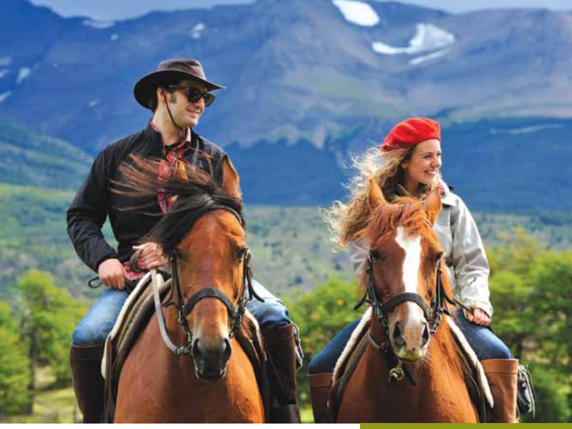
Horseback riding; (below right) Moutain biking in the Lake District

On this exclusive HBS journey, embark on a captivating 12-day journey through the vast, pristine wilderness of Patagonia. After touring the vibrant metropolis of Santiago, head south to Chile's Patagonian Lake District, a region of snow-capped volcanoes, crystal clear lakes and mystic forests. Your first stop will be Pucón and the lovely Vira Vira lodge. Choose from tailor-made adventures such as trekking in a national park, horseback riding with a Chilean huaso (cowboy), white-water rafting on the Trancura River, kayaking on Lake Tinquilco, or mountain biking to the foot of the Villarrica Volcano. Travel onward to the Hotel AWA, perched along the sparkling shoreline of Lake Llanguihue, just outside of Puerto Varas. Enjoy a private excursion to Petrohué Falls and explore Vicente Pérez Rosales National Park. Finally, head to Puerto Natales, gateway to Patagonia's crown jewel, Torres del Paine National Park, set amid monolithic granite spires, azure colored lakes, and glaciers. The Singular Patagonia lodge offers a comfortable base from which to choose from a number of excursions both in and surrounding the park including a boat trip to massive glaciers, spectacular kayaking, horseback riding, bird-watching, and biking.