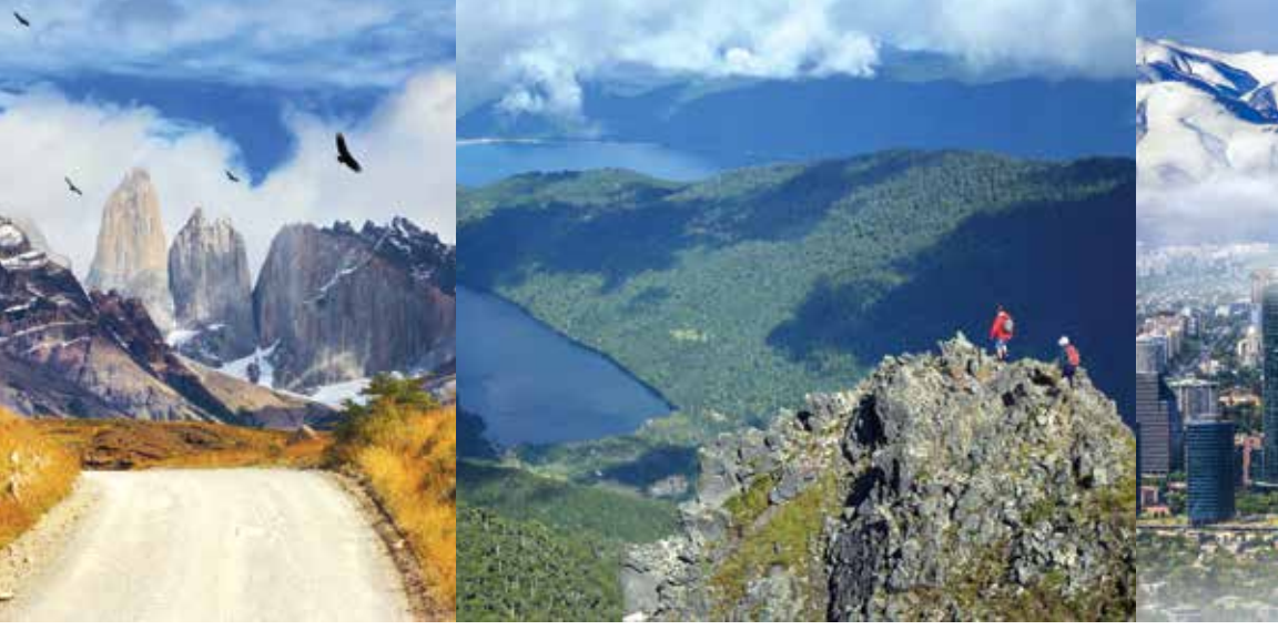
Torres del Paine; Huerquehue National Park; Santiago