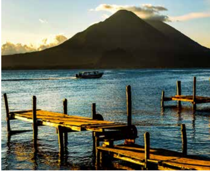
Left: Archaeologist guide at Tikal, Right: Lake Atitlán