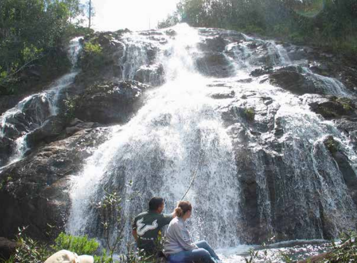
Above: Waterfalls at Hidden Valley Inn private reserve

Escape to Central America for the perfect winter getaway. Belize and Guatemala offer some of the most breathtaking scenery: thick tropical forests stretching up towards the misty heights of the sparsely populated Maya Mountains, extraordinary Maya archaeology, exuberant wildlife, Spanish colonial heritage, impressive volcanoes, and a vibrant indigenous culture. Discover two amazing Central American countries, while staying in charming, luxurious, tropical boutique hotels and lodges.