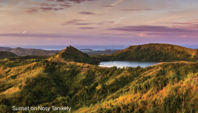
Sunset on Nosy Tanikely