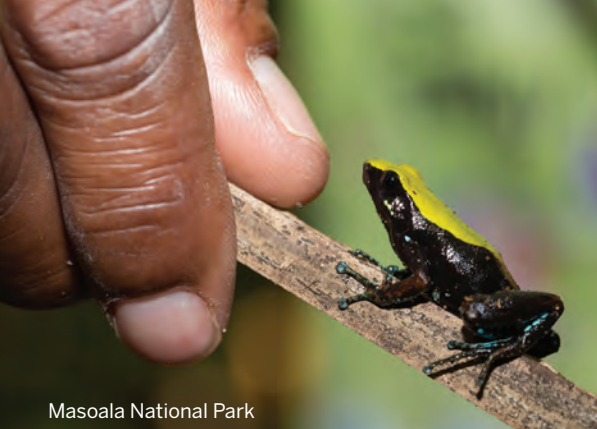
Masoala National Park