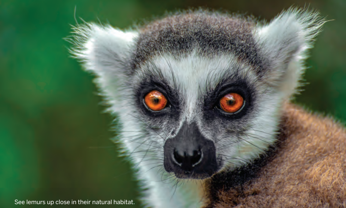
See lemurs up close in their natural habitat.

This is an extraordinary cruise for those who love the natural world and all its wonders. The star is Madagascar, a thousand-mile island boasting an impressive variety of spectacular landscapes from pristine coral reefs and coastal mangroves to virgin rain forests and native groves of Baobab trees. Geographically isolated for millions of years, nearly all of Madagascar's intriguing animals and plants are found nowhere else on Earth, including nearly 100 varieties of lemurs. Madagascar's people are also unique, having descended from Malay-Polynesian mariners, slaves from Africa, as well as traders from Arabia, India, and Portugal.