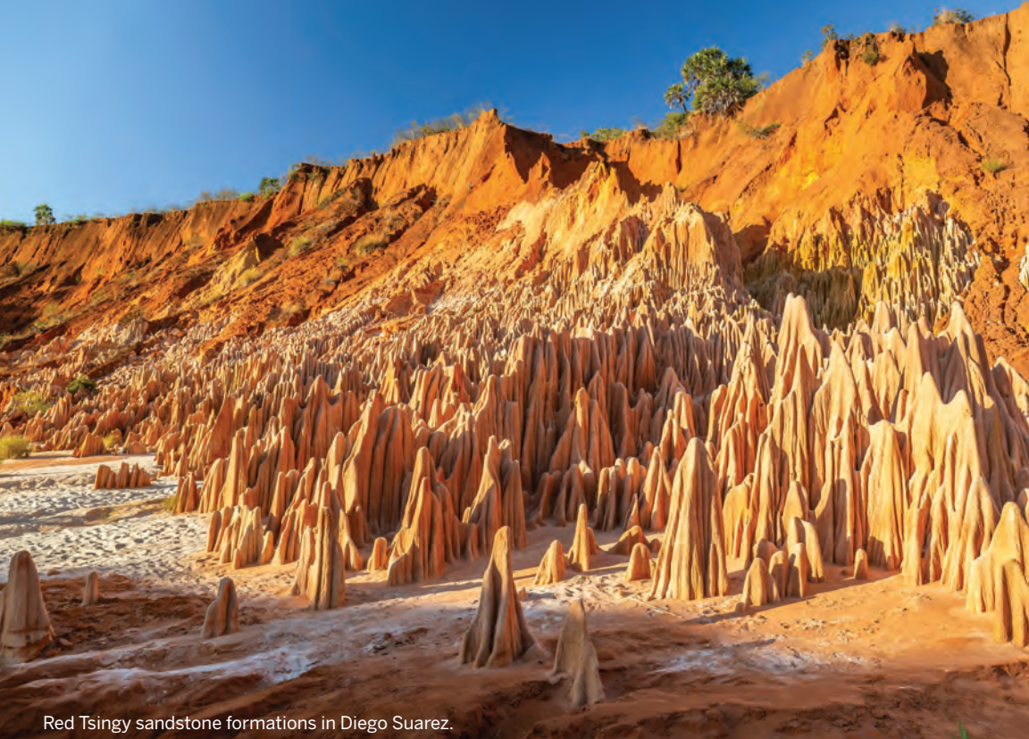
Red Tsingy sandstone formations in Diego Suarez.