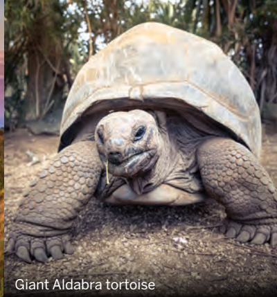
Giant Aldabra tortoise

exploring Nosy Mangabe, a small island reserve of virgin rainforest, and home to a unique nocturnal lemur called the aye-aye. Take the Zodiacs ashore for nature walks and hopefully spot black and white ruffed lemurs, colorful paradise flycatchers, and many other types of wildlife.