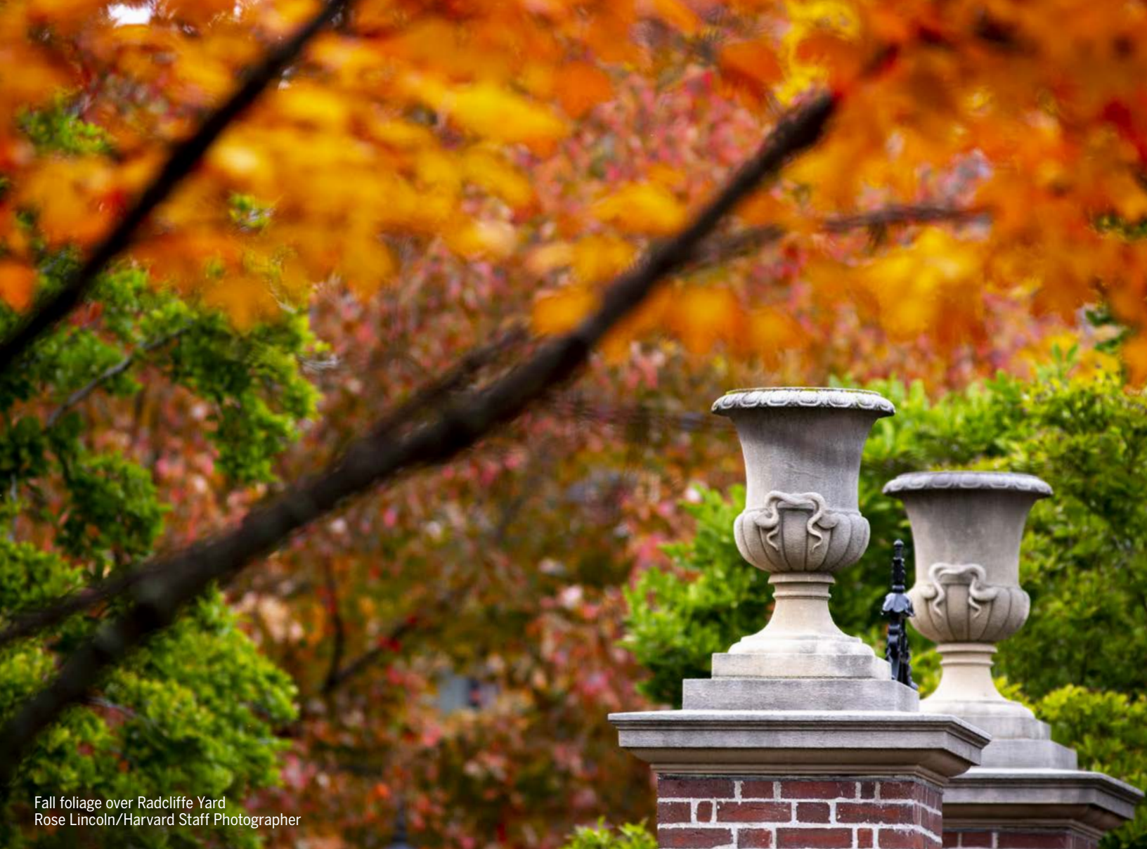
Fall foliage over Radcliffe Yard