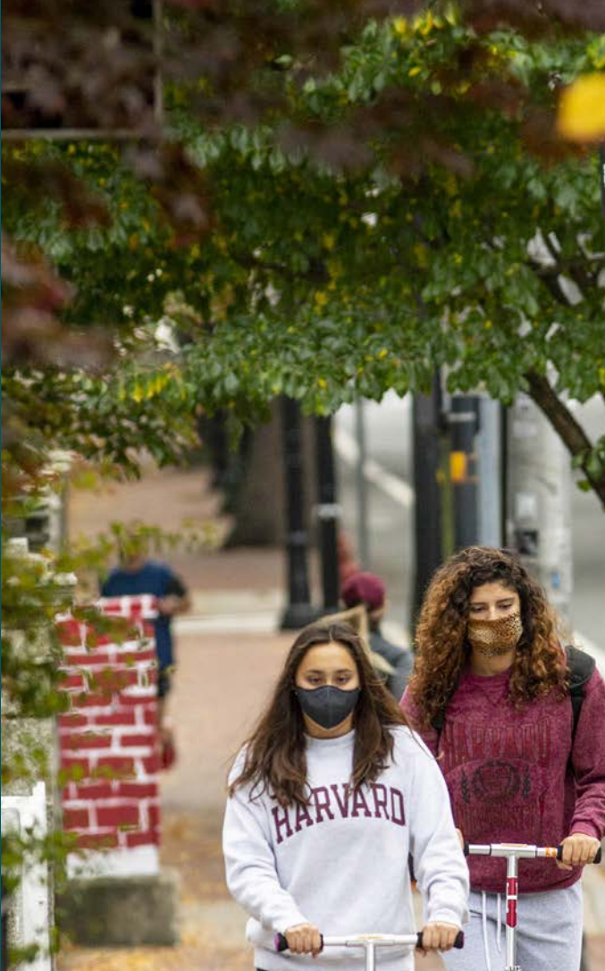
ABOVE: Students scoot up JFK Street towards the Square.