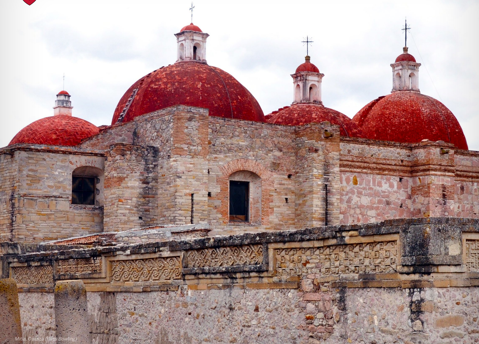
Mitla, Oaxaca

HARVARD ALUMNI ASSOCIATION 2017 WORLDWIDE TRAVEL PROGRAM