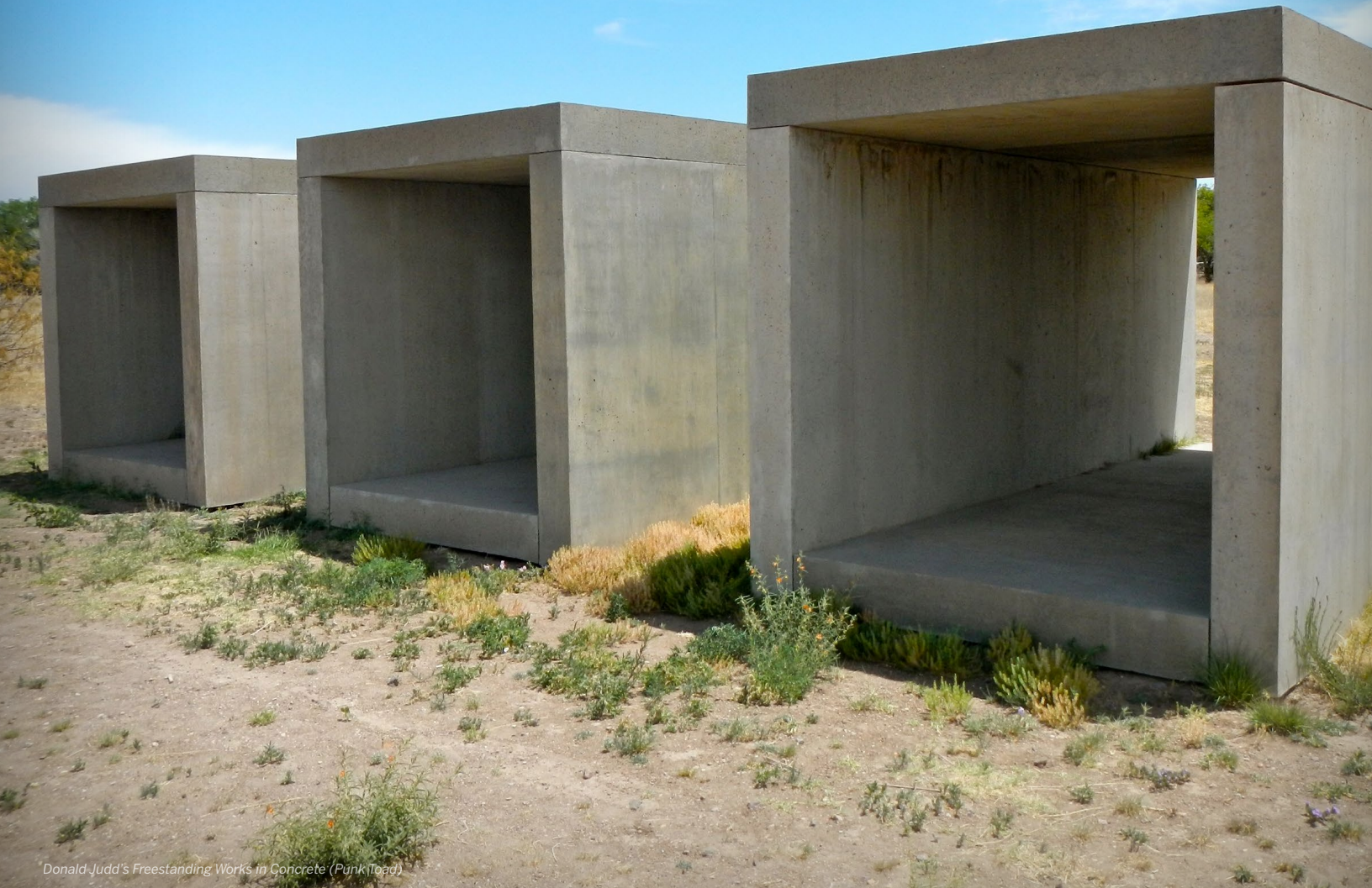
Donald Judd's Freestanding Works in Concrete (Punk Toad)

HARVARD ALUMNI ASSOCIATION 2017 WORLDWIDE TRAVEL PROGRAM