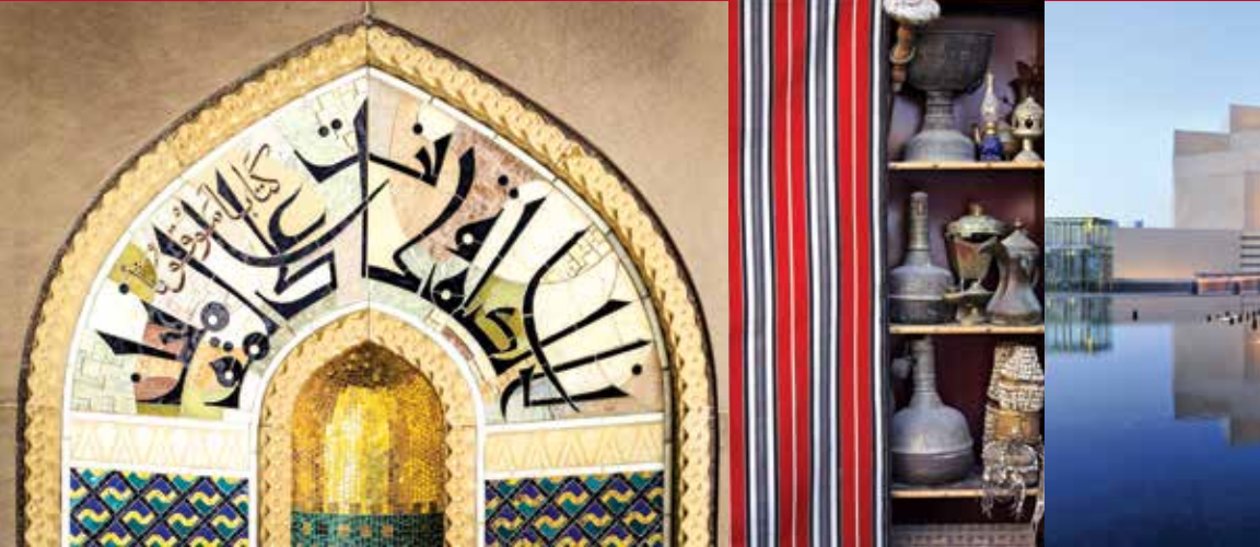
Tradition and innovation go hand in hand in the Middle East, as seen in the beautifully detailed interior of the Sultan Qaboos Grand Mosque in Muscat, Oman; the Museum of Islamic Art in Doha, designed by I. M. Pei; and (below), the falcons trained to hunt, a popular and long-established sport in the Middle East.

TUESDAY, NOVEMBER 29– WEDNESDAY, NOVEMBER 30