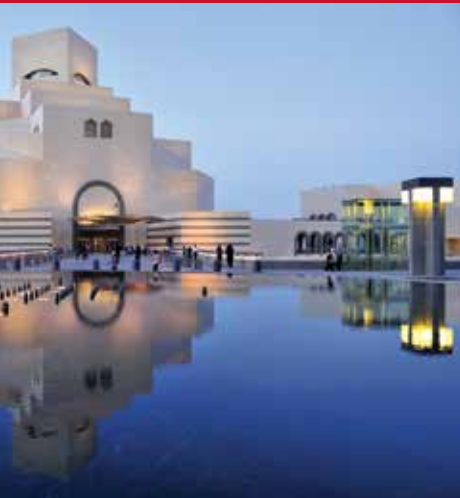
uscat; the craftware available in local souqs; iddle East.